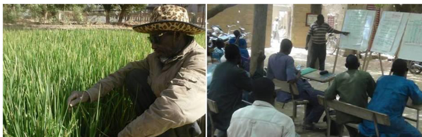
Fig. 1 A farmer observing rice panicle length as yield indicator in his plot and a collective discussion on yield indicators

The interviews were transcribed and the meetings were recorded to collect information on the “indicators” and “factors” cited by the producers. First, “indicators” (or “factors”) corresponding to the same (or very close) visual reference (or driver) were pooled using the same word. Then, the number of times each “indicator” was cited by the producers was totaled (Table 1), and the same was done for each “factor” influencing each “indicator.” The total number of citations of each “factor”