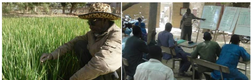
Fig. 1 A farmer observing rice panicle length as yield indicator in his plot and a collective discussion on yield indicators

Semi-open interviews were conducted in the field (next to the producer’s plot), using the local language (Bambara) with the person directly in charge of crop management (who is not necessarily the owner of the plot). The interview comprised a list of open questions, for instance: “Do you use any visual observations (“indicators”) to judge if your rice yield will be good or bad? What are these most important visual references (“indicators”)?” How and when do you observe each one? Are they linked, and if so, how? Do any drivers (“factors”) directly or indirectly influence these visual references (“indicators”)?” How?