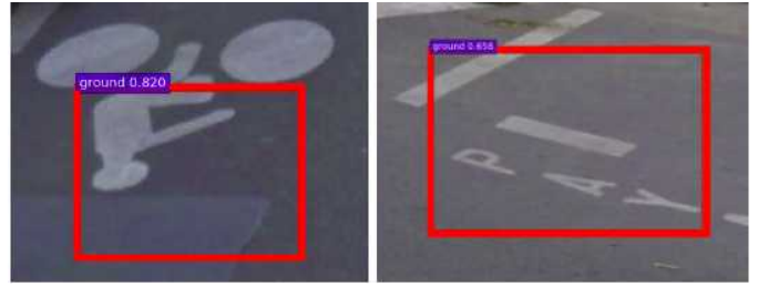
Fig. 3. The false positive detections are mostly associated with the white road surface (B) shown in Fig. 2.

To evaluate the performance of our method, we split the whole dataset into a training dataset (70%), a validation dataset (15%), and a test dataset (15%). This test dataset included different panoramic images from both cities (Vannes and Paris) to represent different backgrounds. The overall detection accuracy of the method was 85%. Detection accuracy for road