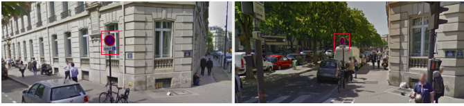
Fig. 1. The same sign (identified by a red bounding box) is captured from different viewpoints, and under different lightening conditions.