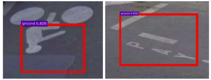
Fig. 3. The false positive detections are mostly associated with the white road surface (B) shown in Fig. 2.

To evaluate the performance of our method, we split the whole dataset into a training dataset (70%), a validation dataset (15%), and a test dataset (15%). This test dataset included different panoramic images from both cities (Vannes and Paris) to represent different backgrounds. The overall detection accuracy of the method was 85%. Detection accuracy for road