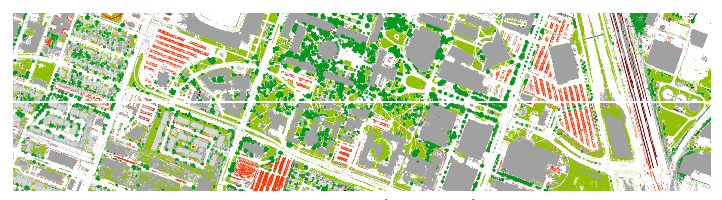
Fig. 2: Classification of the scene using DSDAPs with all features \{N, I, I_r, D, D_r\} . The 7 classes are represented as follows: roads in white, grass in green, trees in dark green, residential buildings in light grey, non-residential buildings in medium grey, cars in red and trains in purple.

2) Classes: We choose generic urban classes (roads, grass, trees, residential buildings, non-residential buildings, cars and trains) of the dataset to evaluate the overall accuracy.