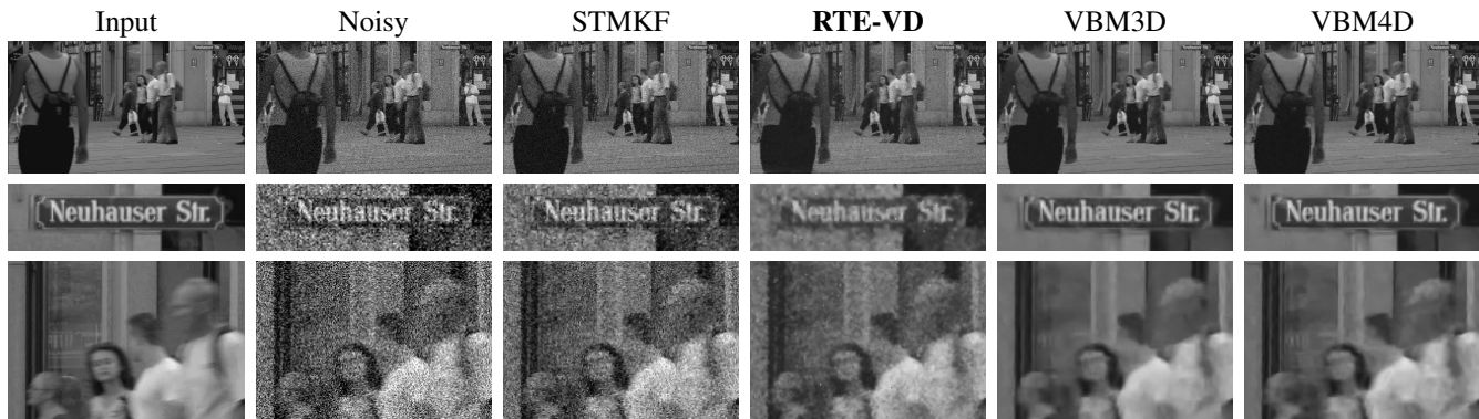
Fig. 2. Visual comparison on pedestrians sequence with a standard deviation noise of 40 (PSNR in Table I).