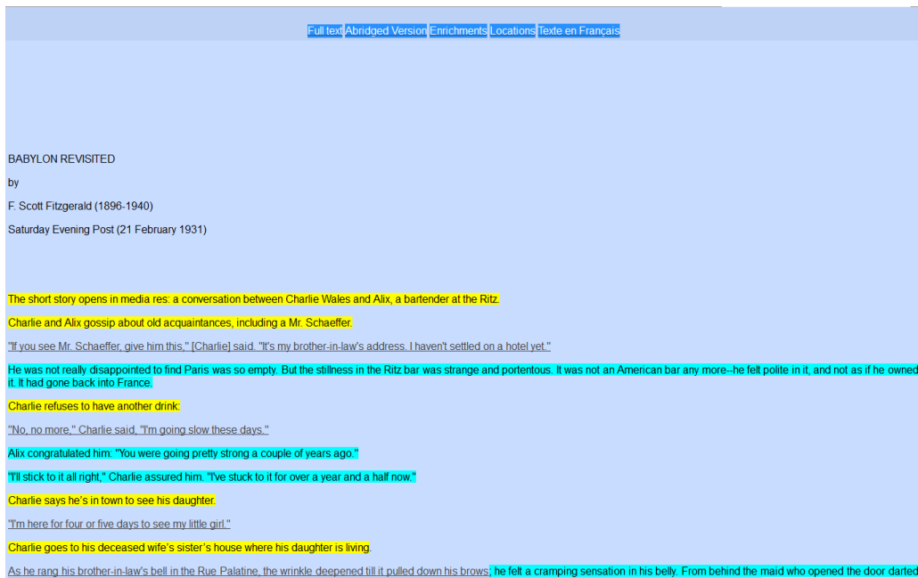
Figure 1 - Color-coded abridged version of the story

The screenshot of our eZB (figure 1), shows the following 5 tabulations: Full text, Abridged Version, Enrichments, Locations, Texte en Français.