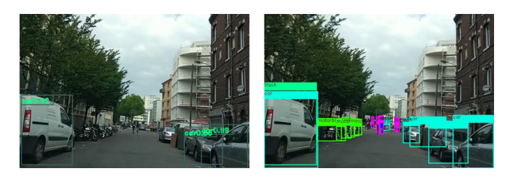
Fig. 1. SSD inference (left) vs YOLO V3 inference (right).

Figure 8 present the results of the inference performed on the SSD and YOLO3.