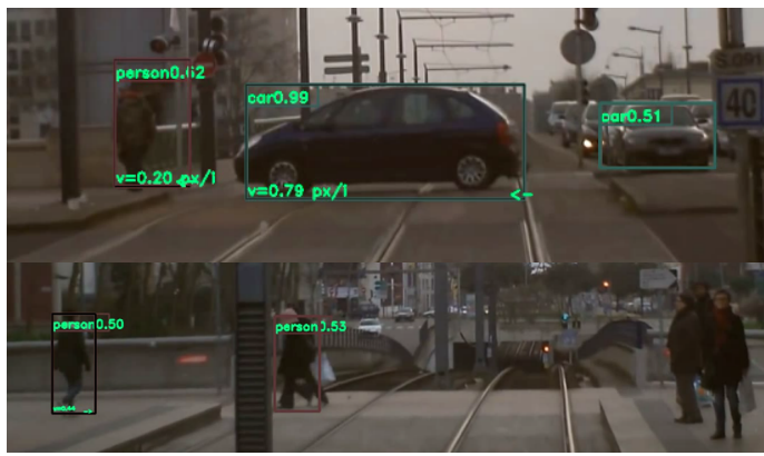
Fig. 9. Examples of tracked pedestrians and vehicle on two parts of images, with estimated direction of motion and speed (in pixels/s). When tracked, objects are marked with estimated speed (at the bottom left corner of the bounding box) and direction of motion (arrow at the bottom right corner) on the abscissa axis of the image. Objects which are tracked are bounded by two rectangles: one with the color of the estimated class and a black one to denote tracking in action

Figure 9 shows examples of application of this principle on two images of a sequence.