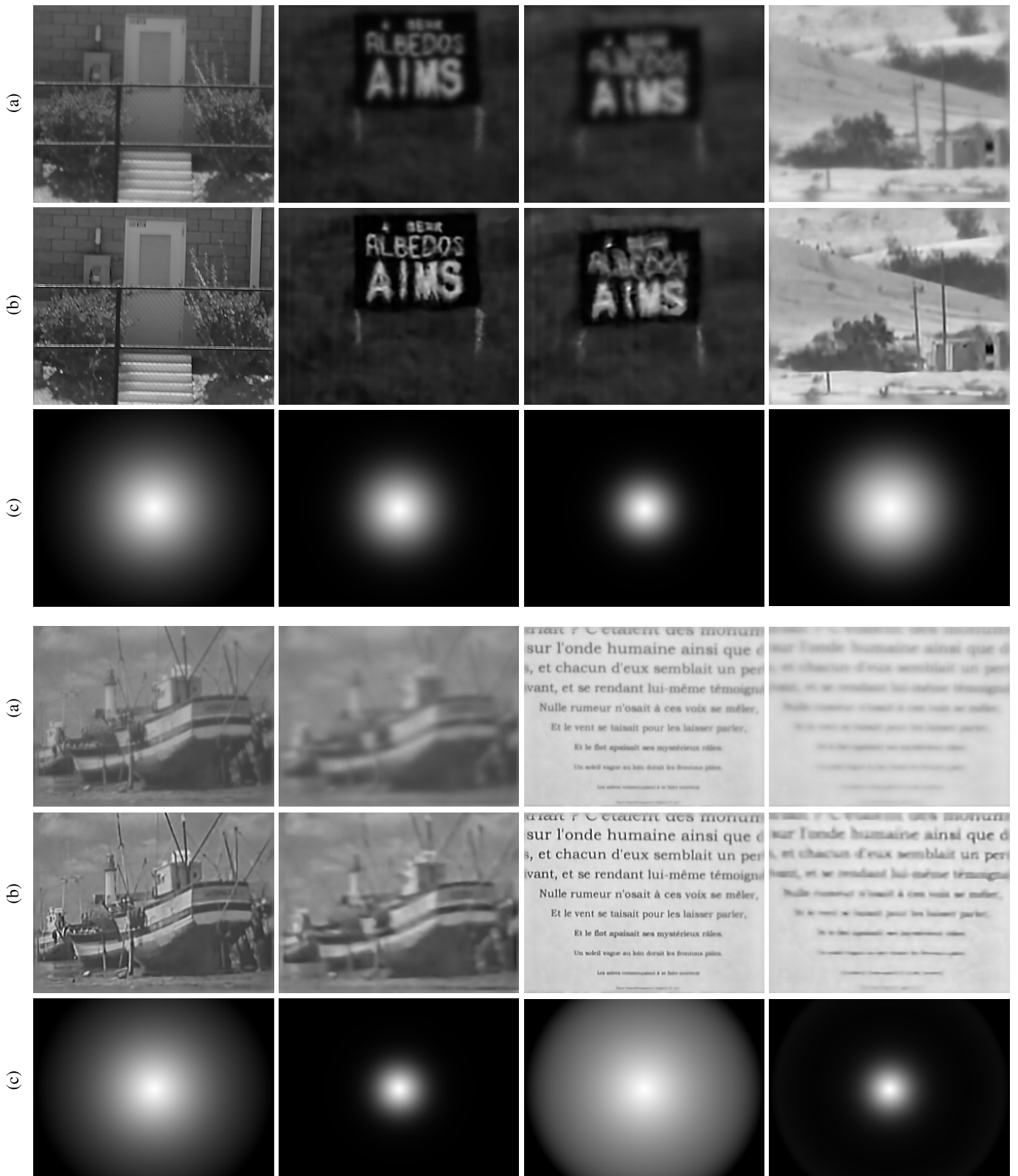
Fig. 5: Results obtained on height images with real atmospheric turbulence. (a) Blurry images y with different levels of turbulence. (b) Deconvolved images. (c) Estimated Fried kernels (the zero frequency is at the center and amplitudes are displayed in log-scale).