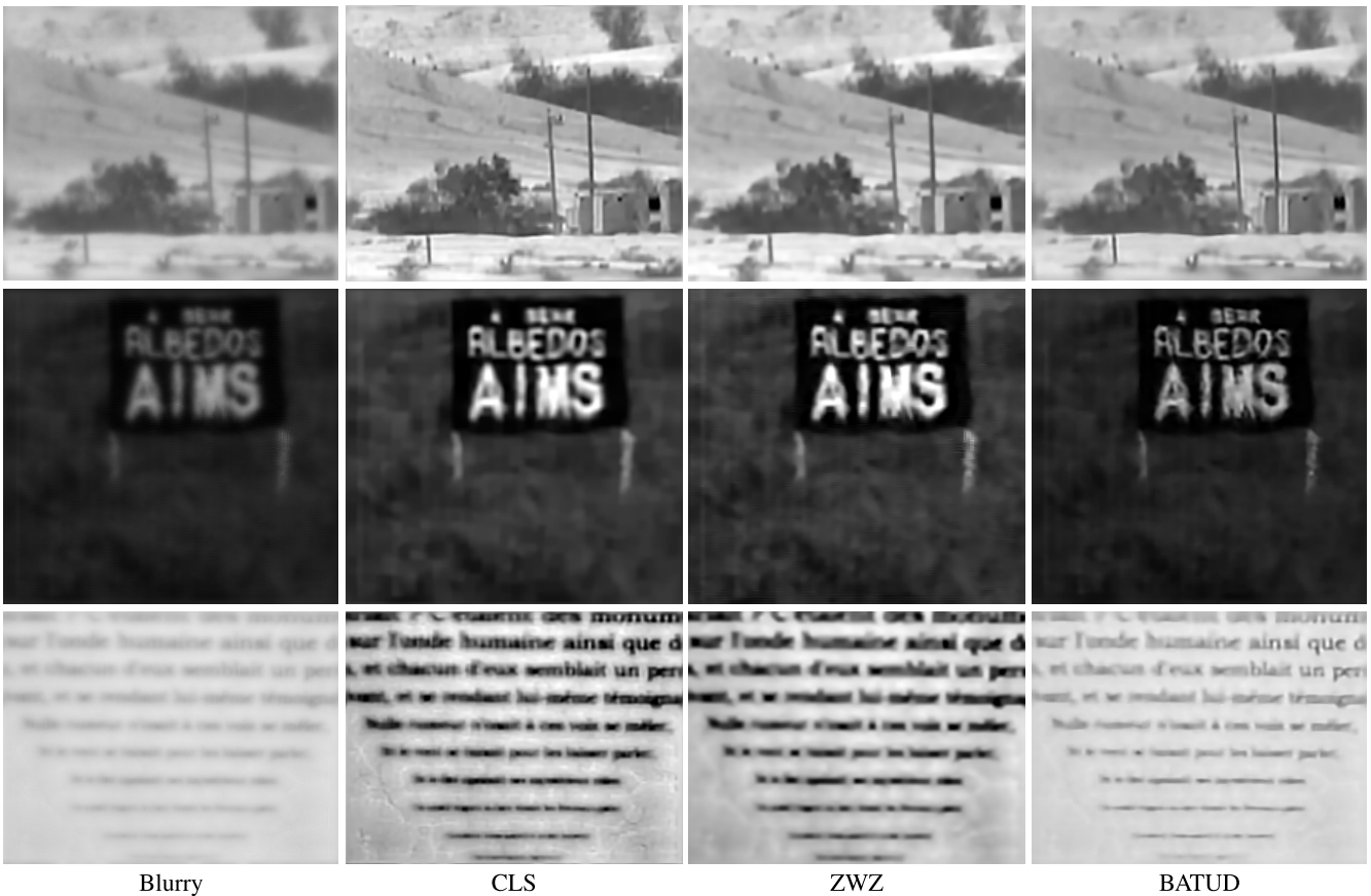
Fig. 6: Comparison of the proposed approach against the CLS and ZWZ blind-deconvolution algorithms on real images.