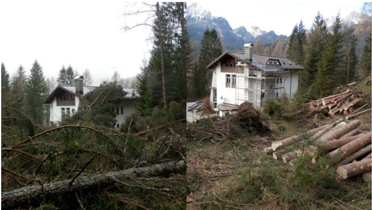
Figure 1. Left: Centre of Studies for the Alpine Environment (Belluno, Dolomites, Italy) on October 30, 2018, on the day after the event. Notice fallen trees on the roof of the building and part of the damages done in its vicinity. Right: Same position two months later (January 4, 2019), with the first restoration works.