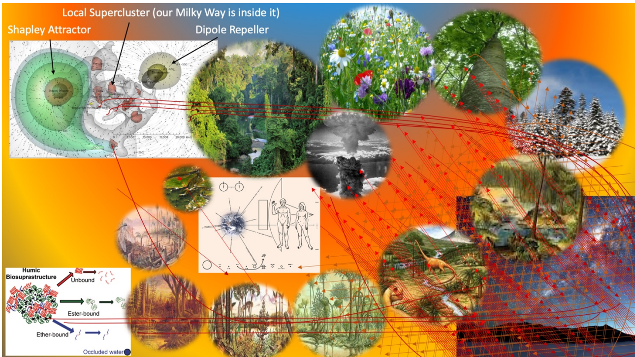
Figure 10. The figure illustrates the evolution of biodiversity on our planet. It develops between the molecular world of the organic substance in the soil and the nearest galaxy clusters. The orange background corresponds to the threat of an average rising air temperature. In the middle, the "Pioneer plaque" launched in 1972 by NASA in the space to indicate our position in the universe to other extraterrestrial living beings.

https://secure.avaaz.org/it/petition/Toshiro_Muto_Tokyo_Organising_Committee_of_the_Olympic_Games_2020_As_planet_Earth_citizens_will_you_stop_the_climate_fro/ .