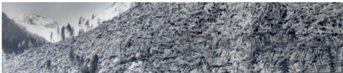
Figure 5. View of the state forest of Cadino Valley, resumed the day after the flood of November 4, 1966, taken from Aprie ( http://www.forestedemaniali.provincia.tn.it/forestedemaniali/cadino/pagina2.html ).

From the net: Fig. 5 and translated text: L'alluvione del 1966 (The flood of 1966) ( http://www.forestedemaniali.provincia.tn.it/forestedemaniali/cadino/pagina2.html )