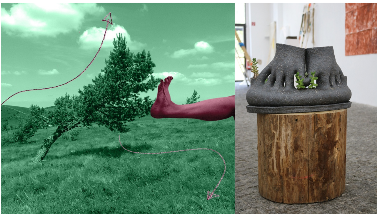
Figure 9. Left: Vertimus . Instead of opposing the forces of nature, why not indulge their natural evolutionary tendency, inserting us into the mechanism as all other living beings do with innate mastery? Considering the soil as source of life. Right: Se planter , Plant yourself.

(composition, layout and color by Karine Bonneval