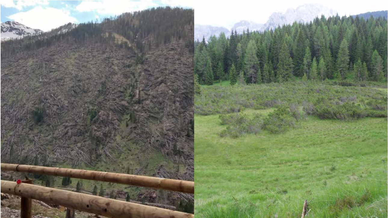
Figure 2. Left: Forest without a mantel, easily subject to wind blows. Cadino Valley, Trento (July 8, 2019). Right: forest with shrubby mantel that resists strong winds. Boite valley, Belluno (July 11, 2019).