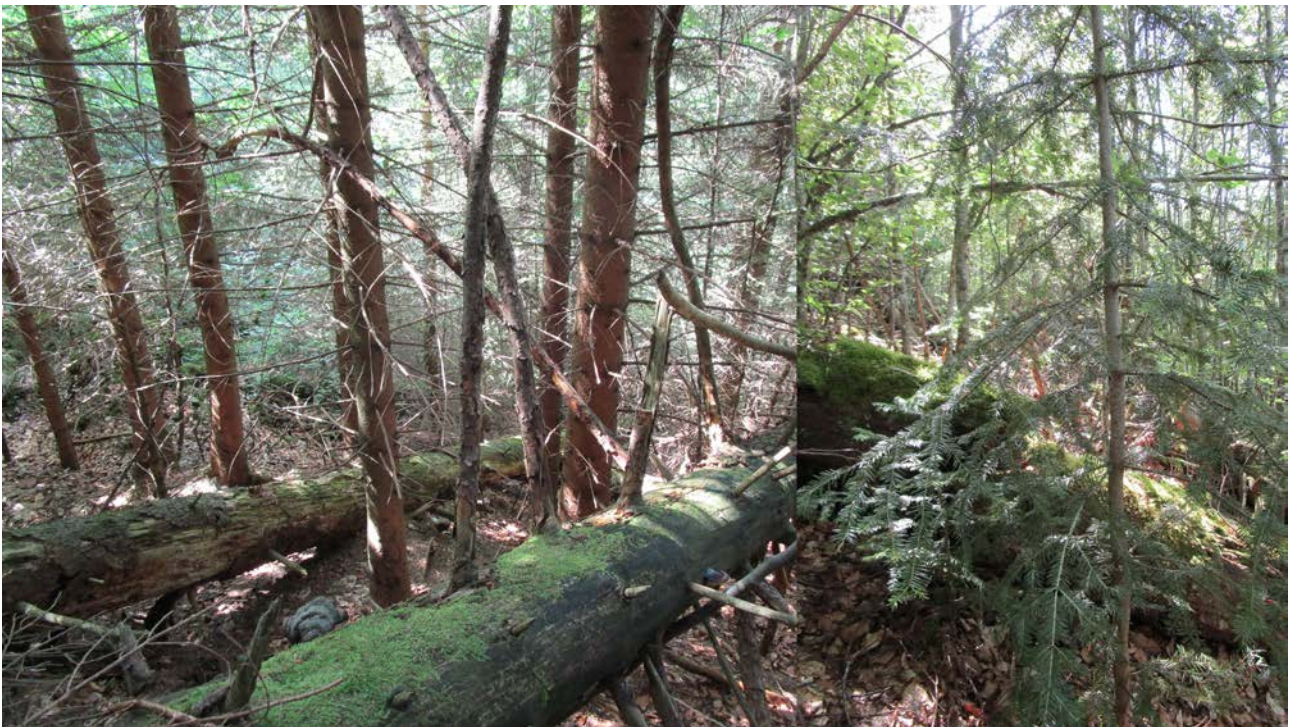
Figure 6. Left: the young spruce trees grow vigorously between the trunks of fallen and decaying trees. Notice how the trunk on the left that touches the ground is more decomposed than the one on the right held up above the ground by its branches. Right: A vigorous silver fir with annual growth in height of 20 cm. Behind him a decomposing trunk covered with mosses. Note that behind the fir branches there are beech and lime to compose a mixed forest. Soil: from Rendzic Phaeozems - Entic Hapludolls to Haplic Cambisols - Inceptic Haprendolls; Humus systems: from Amphi to Mull respectively. The decomposition process appears to be in line with the provisions in Table 1 and Fig. 7, between the lines of Mull and Amphi-Moder systems.

the woman a position equal to that of man and to family, school and administration well-safeguarded and respected roles, an agriculture equipped in a way adapted to the mountain (which respects the environment), a viability impeccable and well maintained, a trade in quality products and protected by brand, a tourism made up of small niches distributed over the territory and, finally, an attention given to the political and administrative class of the area that has been able to control and distribute also the important financial resources (because the Region has a special statute) coming from the Italian State. The same resources also given to other special Italian Regions produced more mitigated effects. In reality, an economic system and a society work only if supported by sound principles of respect for the environment and