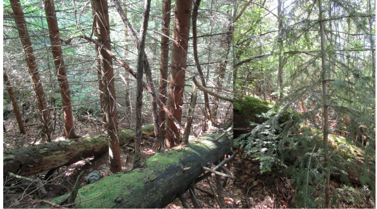
Figure 6. Left: the young spruce trees grow vigorously between the trunks of fallen and decaying trees. Notice how the trunk on the left that touches the ground is more decomposed than the one on the right held up above the ground by its branches. Right: A vigorous silver fir with annual growth in height of 20 cm. Behind him a decomposing trunk covered with mosses. Note that behind the fir branches there are beech and lime to compose a mixed forest. Soil: from Rendzic Phaeozems - Entic Hapludolls to Haplic Cambisols - Inceptic Haprendolls; Humus systems: from Amphi to Mull respectively. The decomposition process appears to be in line with the provisions in Table 1 and Fig. 7, between the lines of Mull and Amphi-Moder systems.