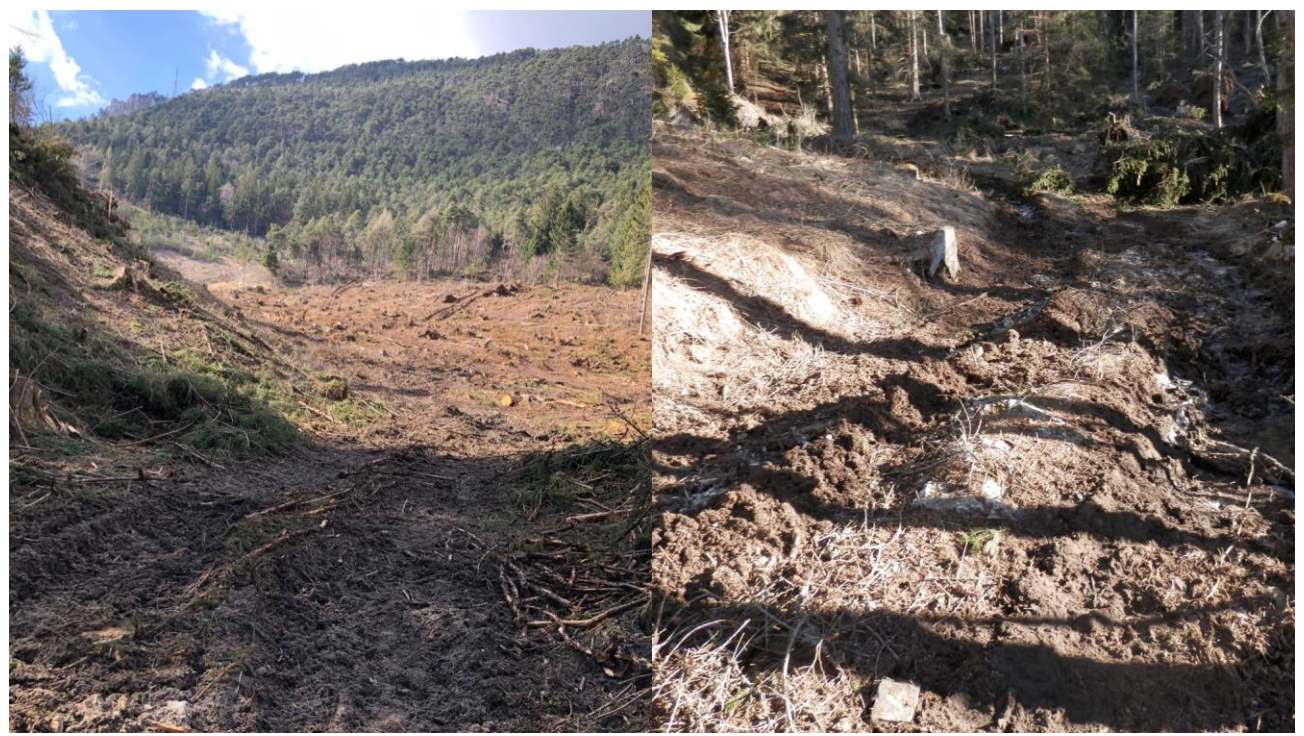
Figure 4. The passage of mechanical machinery necessary for the removal of fallen trees causes irremediable injuries to the soil. Near Perarolo (Belluno province) (photographs: Augusto Zanella, May 4, 2019).