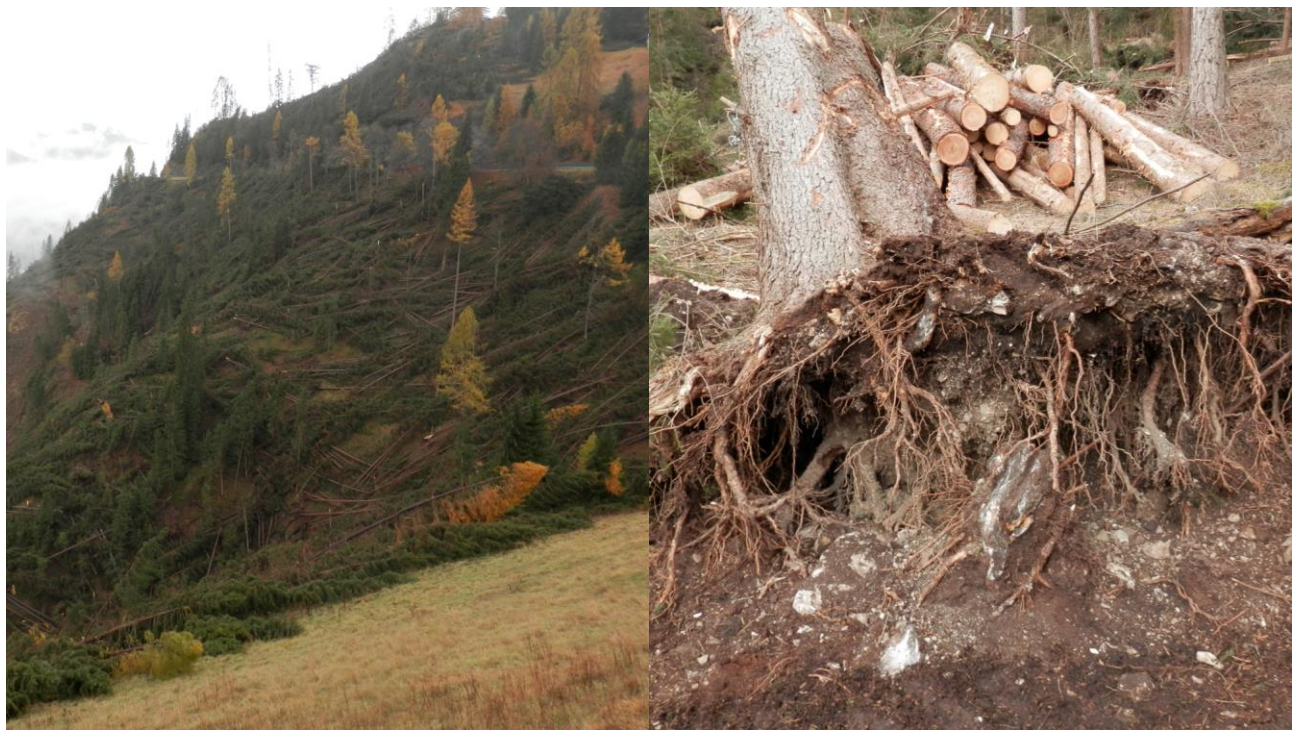
Figure 3. Left: In this population of spruce and larch destroyed by the Vaia storm, only some larches remained standing. The deeper, more solid root system and the lighter foliage probably made the difference. Right: the root system of Picea abies does not allow isolated trees to withstand strong winds.