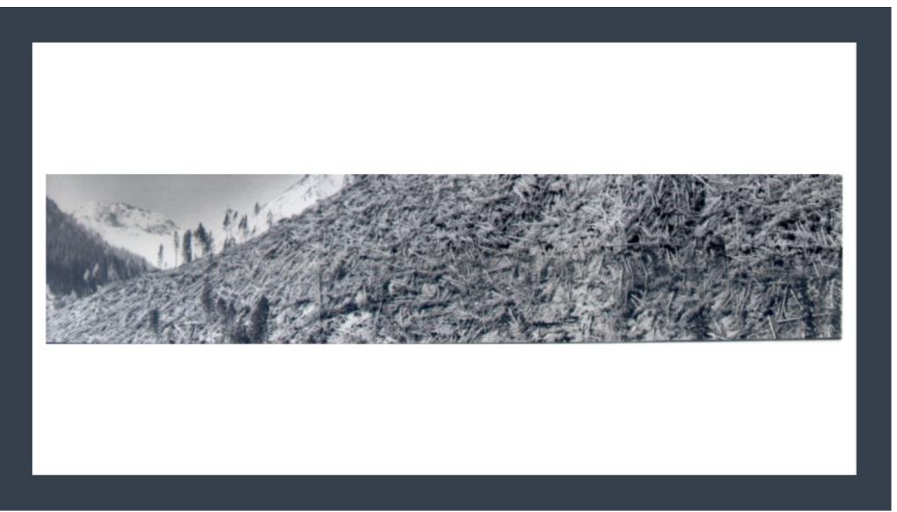
Figure 5. View of the state forest of Cadino Valley, resumed the day after the flood of November 4, 1966, taken from Aprie (http://www.forestedemaniali.provincia.tn.it/forestedemaniali/cadino/pagina2.html).

It was an event that greatly changed the aspect of wooded slopes in the Cadino Valley and the environmental value that the population of Molina and the lower Val di Fiemme attributed to the forest and the cultural landscape. The current structure of the environment and of the wooded stands was modified, in addition to the productive management of natural resources, by the numerous destructive phenomena caused by the wind, the so-called crashes, from water and landslides.