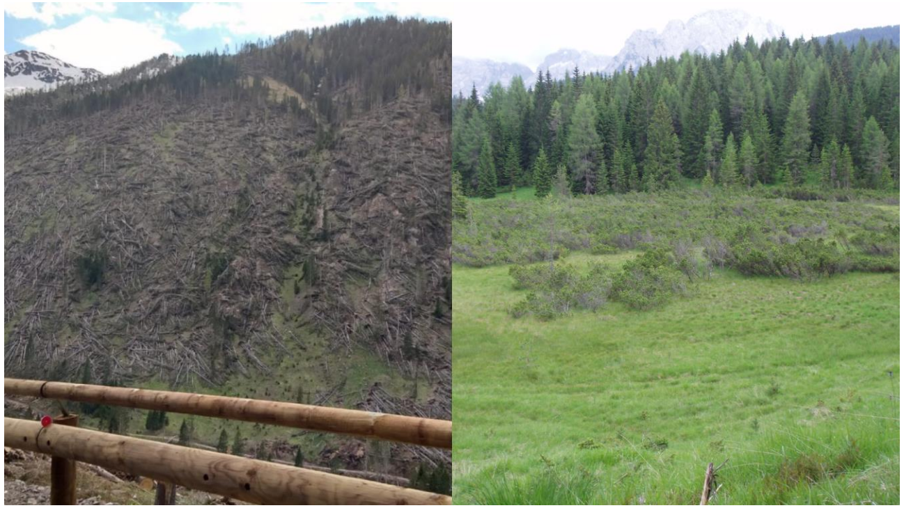
Figure 2. Left: Forest without a mantel, easily subject to wind blows. Cadino Valley, Trento (photograph: Valter Giosele, July 8, 2019). Right: forest with shrubby mantel that resists strong winds. Boite valley, Belluno (Roberto Menardi, July 11, 2019).