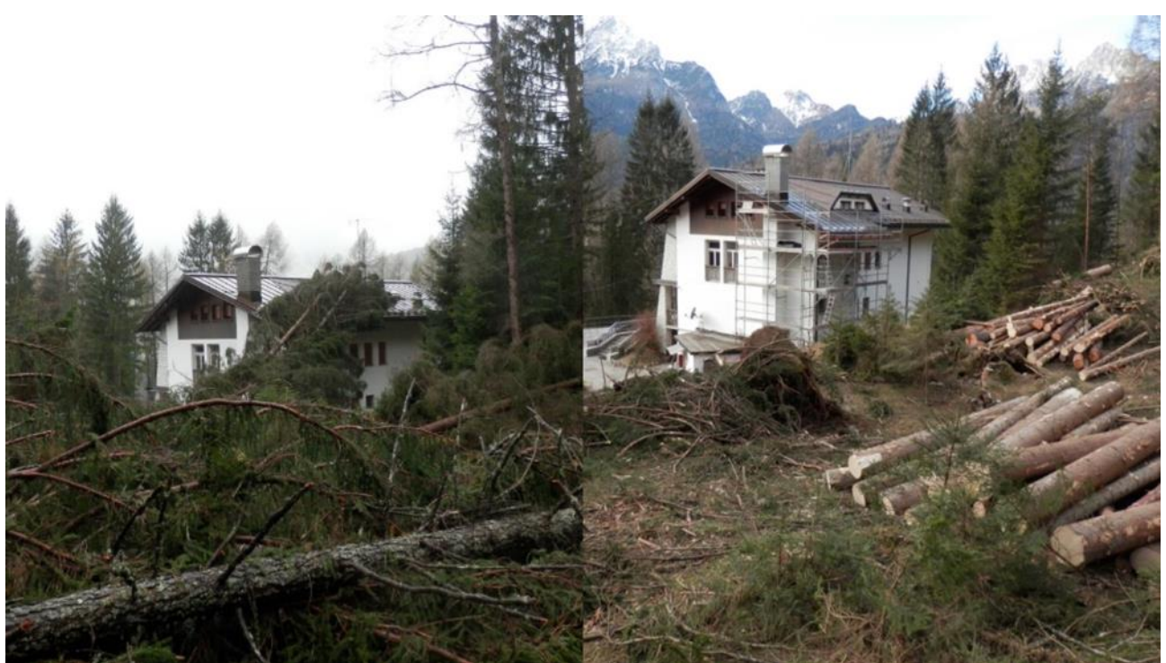
Figure 1. Left: Alpine Ecology Center (Belluno, Dolomites, Italy) on October 30, 2018, on the day after the event. Notice fallen trees on the roof of the building and part of the damages done in its vicinity. Right: Same position two months later (January 4, 2019), with the first restoration works.

authorities through field surveys and interpretation of aerial and satellite images, and with the support of numerous universities and forest research institutes (Fig. 1).