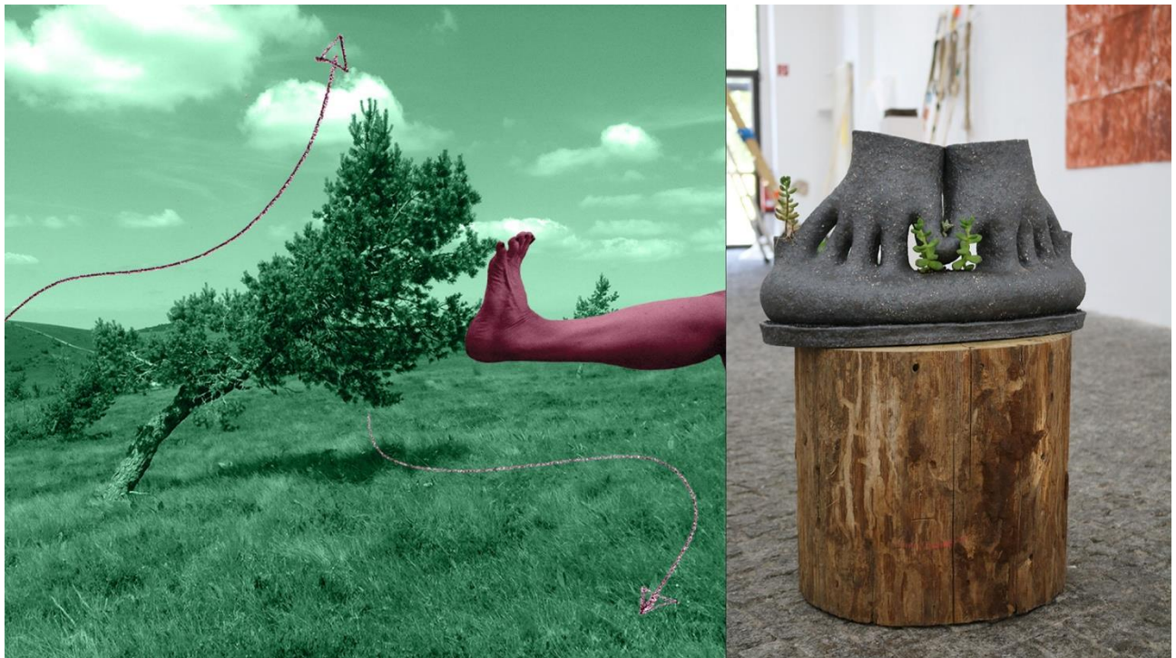
Figure 9. Left: Vertimus. Instead of opposing the forces of nature, why not indulge their natural evolutionary tendency, inserting us into the mechanism as all other living beings do with innate mastery? Considering the soil as source of life. Right: Se planter, Plant yourself.

(Tree photographed by Eric Badel, INRA PIAF; composition, layout and color by Karine Bonneval)