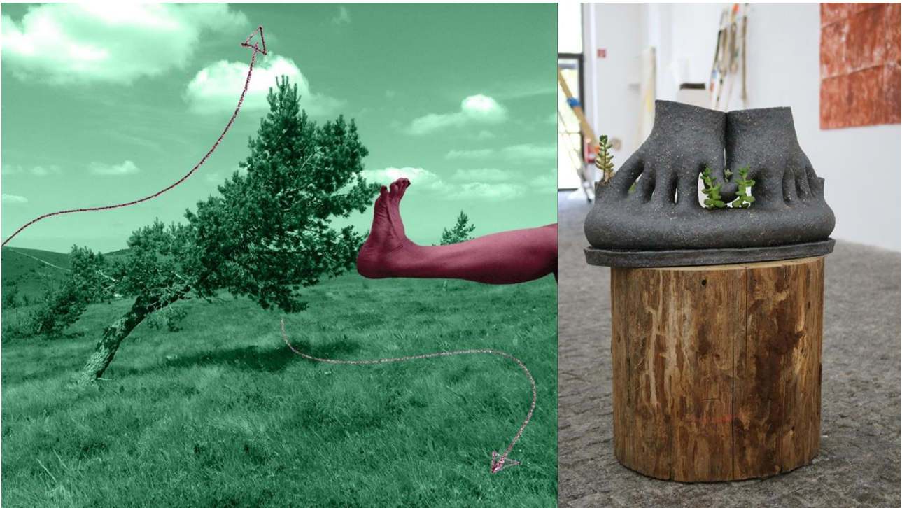
Figure 9. Left: Vertimus . Instead of opposing the forces of nature, why not indulge their natural evolutionary tendency, inserting us into the mechanism as all other living beings do with innate mastery? Considering the soil as source of life. Right: Se planter , Plant yourself.

(Tree photographed by Eric Badel, INRA PIAF; composition, layout and color by Karine Bonneval)