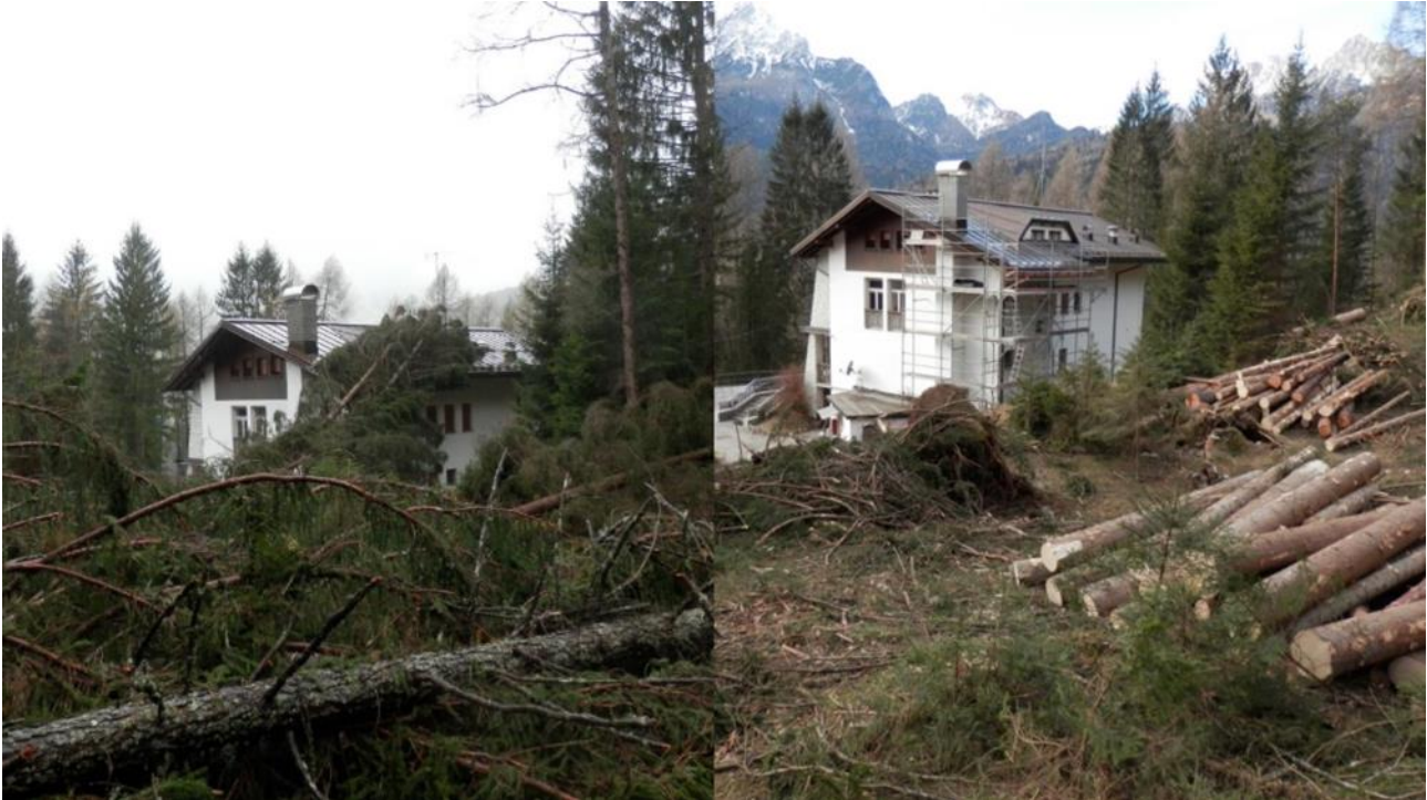
Figure 1. Left: Alpine Ecology Center (Belluno, Dolomites, Italy) on October 30, 2018, on the day after the event. Notice fallen trees on the roof of the building and part of the damages done in its vicinity. Right: Same position two months later (January 4, 2019), with the first restoration works.

authorities through field surveys and interpretation of aerial and satellite images, and with the support of numerous universities and forest research institutes (Fig. 1).