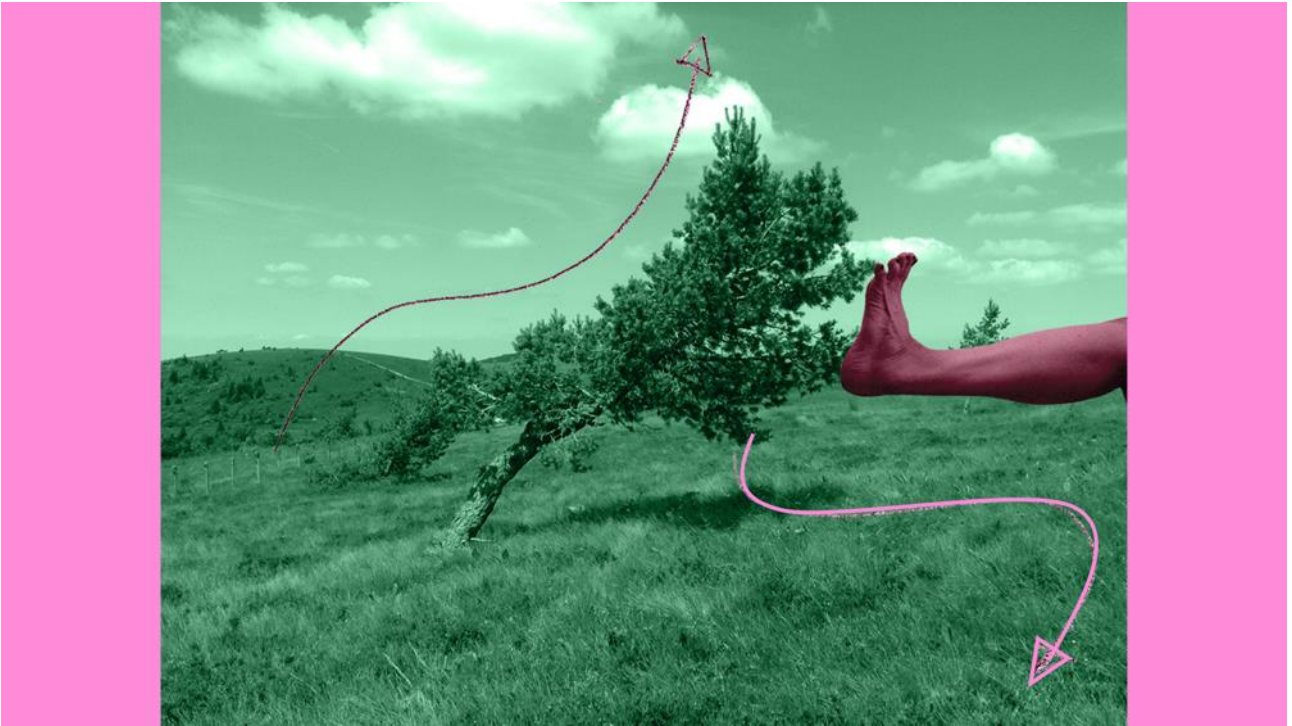
Figure 9. Vertimus. Instead of opposing the forces of nature, why not indulge their natural evolutionary tendency, inserting us into the mechanism as all other living beings do with innate mastery? Considering the soil as source of life.

(Tree photographed by Eric Badel, INRA PIAF; composition, layout and color by Karine Bonneval)