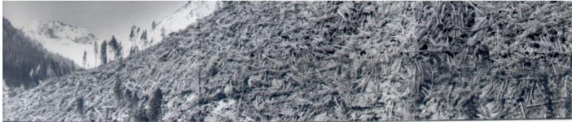
Figure 5. View of the state forest of Cadino Valley, resumed the day after the flood of November 4, 1966, taken from Aprie ( http://www.forestedemaniali.provincia.tn.it/forestedemaniali/cadino/pagina2.html ).

It was an event that greatly changed the aspect of wooded slopes in the Cadino Valley and the environmental value that the population of Molina and the lower Val di Fiemme attributed to the forest and the cultural landscape. The current structure of the environment and of the wooded stands was modified, in addition to the productive management of natural resources, by the numerous destructive phenomena caused by the wind, the so-called crashes, from water and landslides.