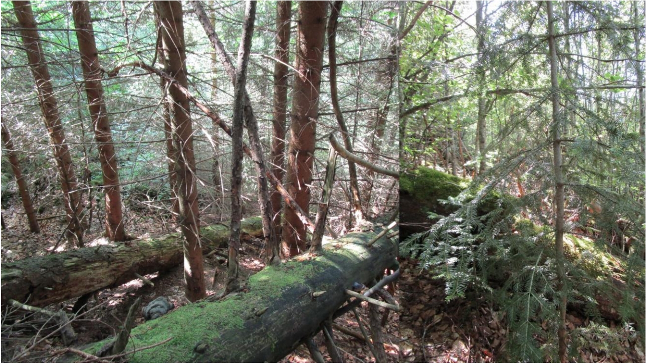
Figure 6. Left: the young spruce trees grow vigorously between the trunks of fallen and decaying trees. Notice how the trunk on the left that touches the ground is more decomposed than the one on the right held up above the ground by its branches. Right: A vigorous silver fir with annual growth in height of 20 cm. Behind him a decomposing trunk covered with mosses. Note that behind the fir branches there are beech and lime to compose a mixed forest. Soil: from Rendzic Phaeozems - Entic Hapludolls to Haplic Cambisols - Inceptic Haprendolls; Humus systems: from Amphi to Mull respectively. The decomposition process appears to be in line with the provisions in Table 1 and Fig. 7, between the lines of Mull and Amphi-Moder systems.