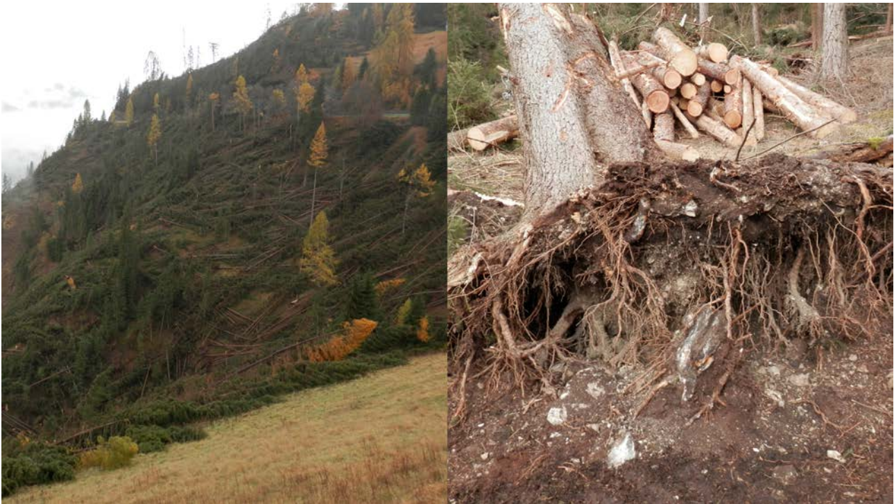
Figure 3. Left: In this population of spruce and larch destroyed by the Vaia storm, only some larches remained standing. The deeper, more solid root system and the lighter foliage probably made the difference (photograph: Roberto Menardi, November 9, 2018). Right: the root system of Picea abies does not allow isolated trees to withstand strong winds (photograph: Roberto Menardi, January 4, 2019).

In forest stands where trees were more diversified in age and species, devastating effects of the wind were more restricted, with a better resistance due to different morphology of the root system (white fir, larch, beech, and other deciduous trees). In damaged areas, only some larches (with little "sail effect" causing canopy rocking) and sometimes hardwoods remained standing. They survived the disaster for "intrinsic properties", not only because they bypassed by crashed vegetation (Fig. 3 Left). Merzari et al. (2018) reported: "Reasonably if we had mixed woods with different species (like spruce, fir, beech, and other species) of different ages able to better use the vertical space of the foliage, and with younger and more elastic plants, all this would have been limited to some portion of the forest". If true, Italian forest managers should end up in jail (there have been deaths and extensive damage). A more diversified forest was promoted for years, even in books of the founder of the Centre for Studies on Alpine Environment (Fig. 1) and President of the School of Forestry Science of the University of Padua (Giannini and Susmel, 2006; Susmel, 1980).