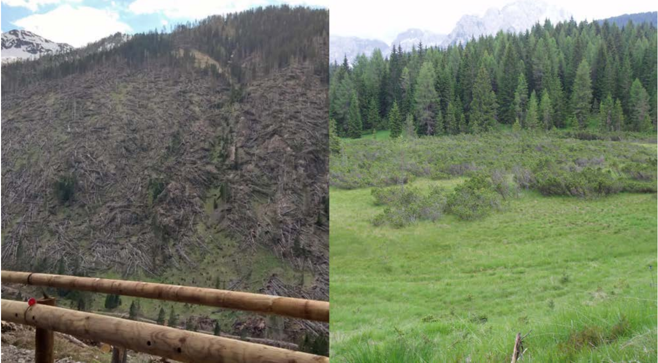
Figure 2. Left: Forest without a mantel, easily subject to wind blows. Cadino Valley, Trento (photograph: Valter Giosele, July 8, 2019). Right: forest with shrubby mantel that resists strong winds. Boite valley, Belluno (Roberto Menardi, July 11, 2019).

What percentage of vegetation would still be left in place if more responsible forest practices had favored a diversification of forest stands (Arts et al., 2013; Bormann and Likens, 2012; Motta et al., 2018)? Besides, great neglect was given meanwhile to the margins of forest stands: compactness of the border vegetation between a meadow and the forest is almost always lacking (Fig. 2, Left compared Right pictures).