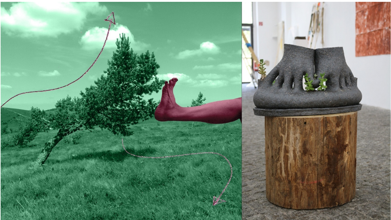
Figure 9. Left: Vertimus. Instead of opposing the forces of nature, why not indulge their natural evolutionary tendency, inserting us into the mechanism as all other living beings do with innate mastery? And considering the soil as a source of life, as shown on the right part of the picture: “Se planter”, “Plant yourself”.

(Tree photographed by Eric Badel, INRA PIAF; composition, layout and color by Karine Bonneval)