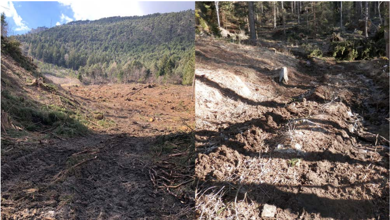
Figure 4. The passage of mechanical machinery necessary for the removal of fallen trees causes irremediable injuries to the soil. Near Perarolo (Belluno province) (photographs: Augusto Zanella, May 4, 2019).