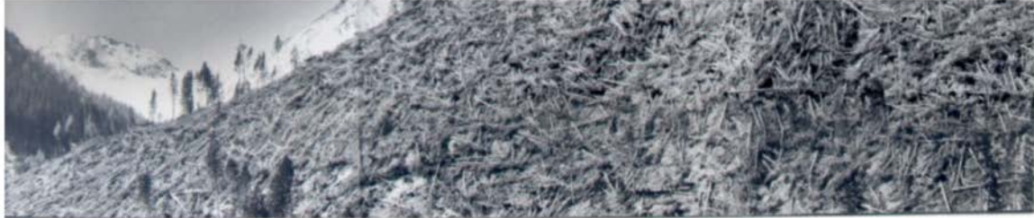
Figure 5. View of the state forest of Cadino Valley, resumed the day after the storm of November 4, 1966

After census of the damage reforestation operations began immediately in the most affected areas, in order to avoid and prevent further damages caused by erosion. For an immediate recovery of forest vegetation more than 150,000 seedlings were planted in the period 1968-1971, almost all of spruce.