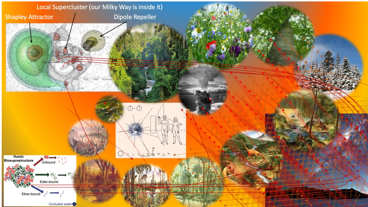
Figure 10. The figure illustrates the evolution of biodiversity on our planet. It develops between the molecular world of the organic substance in the soil and far away to the nearest galaxy clusters. The orange background corresponds to the threat of average rising air temperature. In the middle, the "Pioneer plaque" launched in 1972 by NASA in the space to indicate our position in the universe to other extraterrestrial living beings.

https://secure.avaaz.org/it/petition/Toshiro_Muto_Tokyo_Organising_Committee_of_the_Olympic_Games_2020_As_planet_Earth_citizens_will_you_stop_the_climate_fro/ .