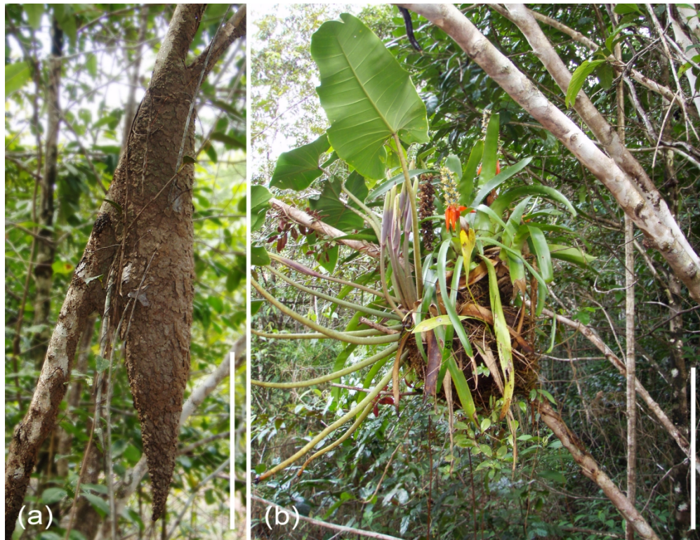
Fig. 1. (a) A large carton nest of Azteca chartifex . (b) A conspicuous ant garden resulting from the association between Camponotus femoratus and Crematogaster levior . The scale bar represents 50cm.