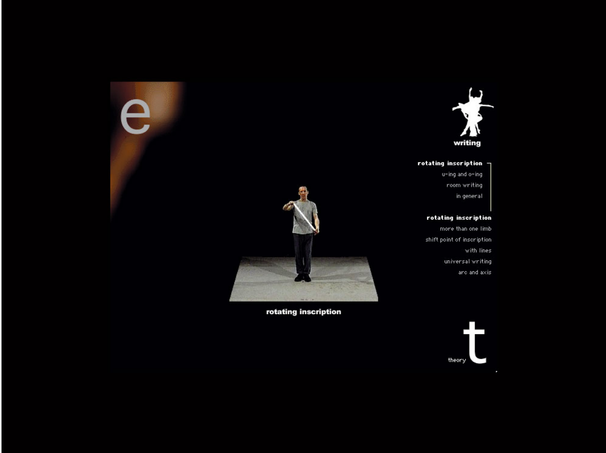
Fig. 1 Improvisation Technologies: A Tool for the Analytical Eye , CD-Rom, 1999, screenshot.