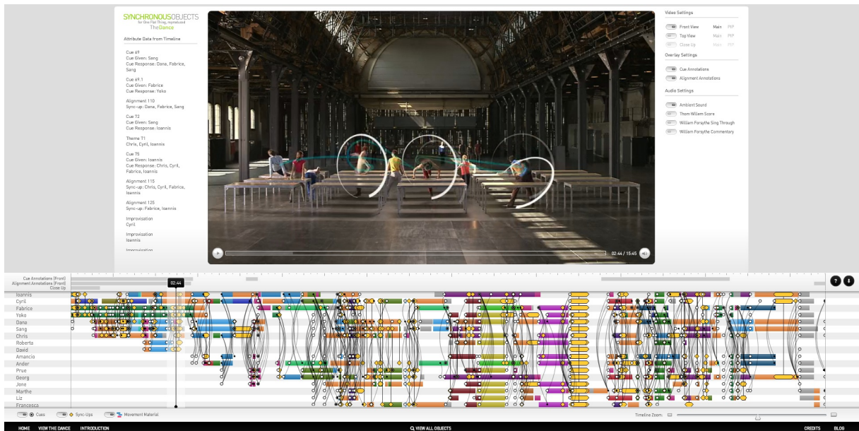
Fig. 2 Synchronous objects for One Flat Thing, reproduced by William Forsythe, site internet, 2009, « The Dance », screenshot.