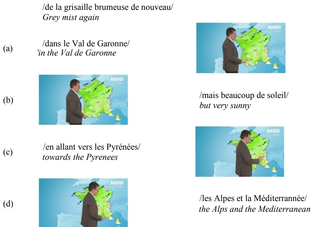
Figure 1. Gesture / speech temporal (mis)alignment in French (Prévisions Météo-France, 17 Nov. 2015).

In sum, the example illustrated in Figure 1 shows that whereas the first and last gestures in the sequence align their apex with the right locations in speech, the second gesture does not align with any spatial location in speech and the third one points at the Alps on the map when the Pyrenees are mentioned in speech. The last gesture produced by the forecaster aligns with one of two locations mentioned in speech. It starts as the Alps are being mentioned but its apex coincides rightly with the mention of the Mediterranean. The gestures in (b) and (c) are then clearly misaligned with their lexical affiliates and the gesture/speech constructions in these two cases seem rather ill-formed, unless one considers that the different elements or objects forming the construction can be analyzed in terms of their respective properties and the relationships they entertain with each other on different planes of discourse (Blache, 2004). These relationships between objects in utterances can be represented in the form of temporal graphs (Bird and Liberman, 1999).