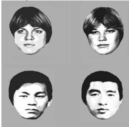
Figure 1. Examples of the face stimuli used.

These photos were digitized using 16 grey levels and they had the same uniformly gray background (see Figure 1). None of the pictures showed persons with facial hair or glasses, and the images were cropped to eliminate clothing cues. From the 24 Caucasian faces (12 males and 12 females) and the 24 Asiatic faces (12 males and 12 females), twenty-four pairs of faces were generated – 12 pairs of Caucasian faces (6 male pairs and 6 female pairs) and 12 pairs of Asiatic faces (6 male pairs and 6 female pairs). The faces were paired so as to minimize differences in the shape of the hairline.