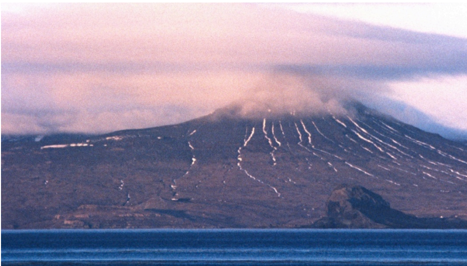
Figure 4 - Presqu'île Ronarc'h and the Mont du Pouce (744 m.) at sunset, Kerguelen Islands. (photo: B. Raoulx, 1986.)

involved. In 1915 the name Joffre (referring to Marshal Joffre, considered as one of the main figures in the Allied victory during the World War I) was given by the Service Hydrographique de la Marine, the French naval hydrographic service, to another presqu'île on the northern shore that had been previously named the Bismarck Halbinsel (Bismarck peninsula) by the German Gazelle scientific expedition in 1874. During the First World War the French started to rename the region's toponymic features, rejecting many German names. This resulted in two places in different locations using the name Jeanne d'Arc: Port Jeanne-d'Arc, on the south-eastern coast, where a whaling factory was established in 1909 that operated for few years (the very French place name was chosen by the Anglo-Norwegian company that opened the factory, presumably in an attempt to please the French authorities) and the Presqu'île Jeanne d'Arc in the north. In order to avoid this mismatch, the Commission switched the names of the two presqu'îles . The former Presqu'île Joffre in the South became the Presqu'île Jeanne d'Arc and the former Presqu'île Jeanne d'Arc in the North became the Presqu'île Joffre, as it is today (Figure 3).