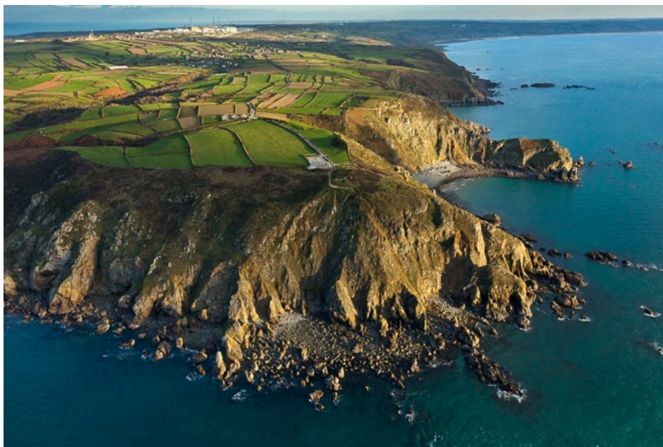
Figure 5 - Aerial picture of La Hague: in the foreground, the Cap de la Hague, in the background, the Nez de Jobourg. At the rear, on the left side, the nuclear waste recycling plant operated by Areva.

The Cotentin (a name that derives from the town of Coutances) is an isolated area of land in northwestern France (Figure 6) that is generally characterised as a presqu'île by its inhabitants. Located on Cotentin's northern coast, the main city, Cherbourg, has long been a strategic harbour for the French Navy. In recent decades the Cotentin has come to be commonly referred to as a presqu'île du nucléaire ('nuclear peninsula') on account of the location of two nuclear facilities in the area (the waste recycling unit at La Hague, operated by the Areva company since 1960, and the Flamanville nuclear power plant, established in 1983, which is currently due to be extended).