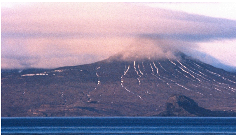
Figure 4 - Presqu'île Ronarc'h and the Mont du Pouce (744 m.) at sunset, Kerguelen Islands.

involved. In 1915 the name Joffre (referring to Marshal Joffre, considered as one of the main figures in the Allied victory during the World War I) was given by the Service Hydrographique de la Marine, the French naval hydrographic service, to another presqu'île on the northern shore that had been previously named the Bismarck Halbinsel (Bismarck peninsula) by the German Gazelle scientific expedition in 1874. During the First World War the French started to rename the region's toponymic features, rejecting many German names. This resulted in two places in different locations using the name Jeanne d'Arc: Port Jeanne-d'Arc, on the south-eastern coast, where a whaling factory was established in 1909 that operated for few years (the very French place name was chosen by the Anglo-Norwegian company that opened the factory, presumably in an attempt to please the French authorities) and the Presqu'île Jeanne d'Arc in the north. In order to avoid this mismatch, the Commission switched the names of the two presqu'îles . The former Presqu'île Joffre in the South became the Presqu'île Jeanne d'Arc and the former Presqu'île Jeanne d'Arc in the North became the Presqu'île Joffre, as it is today (Figure 3).