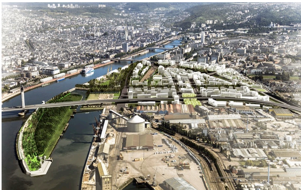
Figure 7 – Rouen, Normandy: Visualisation of Presqu'île park site (left of image).

In the city of Caen, the presqu'île industrialo-portuaire ('industrial harbour peninsula') was created in 1857 as a consequence of the completion of the city's canal system. Running parallel to the Orne river, it provided easy access to Caen harbour, which is located 13 km from the seashore. 9 The activity in these docks declined during the early-mid 20th Century and the relocation of infrastructure further down the canal and on the seashore from the 1960s on, together with the closure of the steel factory in 1993, have left vacant areas ('brownfields'). The current revitalisation project aims to create a new neighbourhood. It has similarities with Rouen's redevelopment and the presqu'île designation functions as a place-name of its own. As in Rouen, the rhetoric of an (almost) island is used to promote the city.