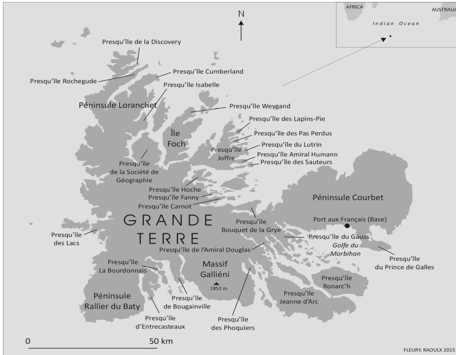
Figure 3 - The Kerguelen Islands and designation of presqu'îles and péninsules (derived from Institut Géographique National map [undated])

Finally, taking into account the extreme indented coastline of the Kerguelen Islands, the commission decided to give the name péninsules to the shapes that would have been called presqu'îles in other places and the name gulfs to indentations that would have been simply considered as bays – such as the case of Péninsule Courbet and the Golfe du Morbihan . (Commission de toponymie, 1973: 4 - authors' translation)