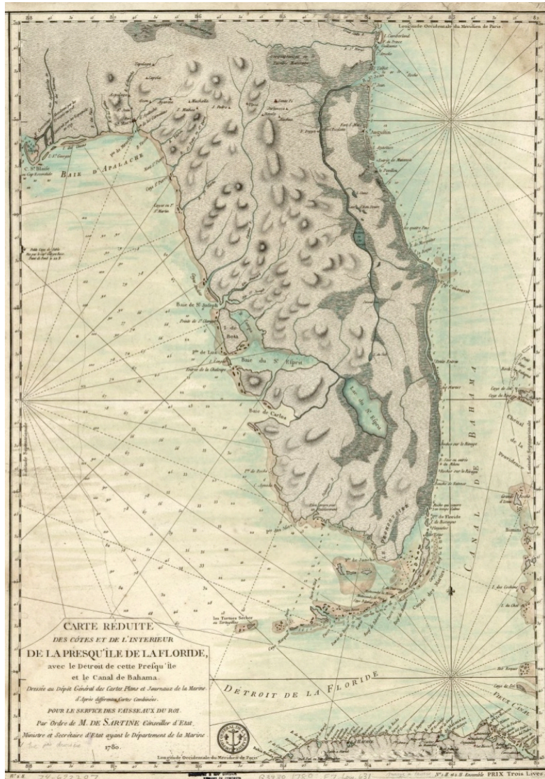
Figure 2 – French map of Florida from 1780 with presqu'île designations. 3

Presqu'île du Lac [Lake Peninsula]). By contrast, in France, the term presqu'île is never used without referring to another place name, often a town or a village (ie presqu'île de Giens – in the Southeast of France – or presqu'île de Crozon, in Brittany), except in the case of cities, as will be discussed later in the article.