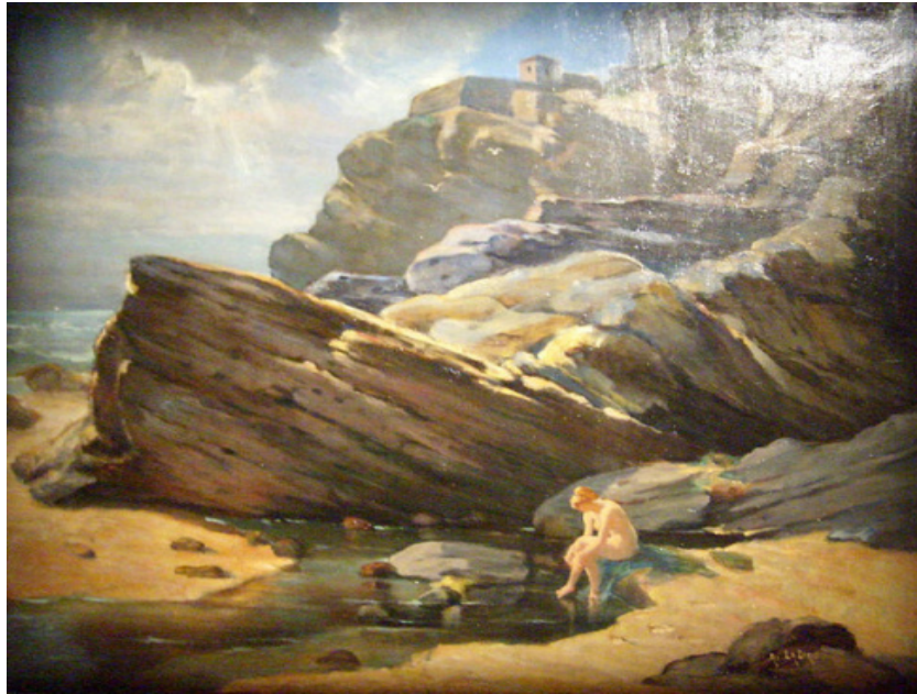
Figure 3 – Lalyre’s ‘Baigneuse sous les rochers du Grand Fort a Carteret’ (date unknown)