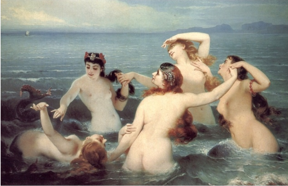
Figure 6 - The seascape in Charles Edouard Boutibonne's "Sirènes jouant dans la mer" (1883).

To some degree, Lalyre's sirènes resemble those represented in Charles Edouard Boutibonne's 'Sirènes jouant dans la mer' ('Sirens Frolicking in the Sea') (1883) (Figure 6). Like Lalyre, Boutibonne was a French painter of the academic classicist school. In his 1883 painting he presents a circle of sirens sea-bathing, with emphasis on their torsos and buttocks, as well as the floating hair of one of the figures. However, Boutibonne's sirènes are ambiguous in form. While the two central figures appear fully human, there is an ambiguity concerning the portion of the figure at right of image that is submerged, and the two figures at the left of the image are explicitly tailed. There is also an implied possibility of interaction with human mariners through the (very subtle) appearance of a ship at the left of the distant horizon. Boutibonne's seas are perceptibly calm and still, softly lapping at the sirens. His females emerge neatly from the water and bask unperturbed as two appear to eye the far away vessel.