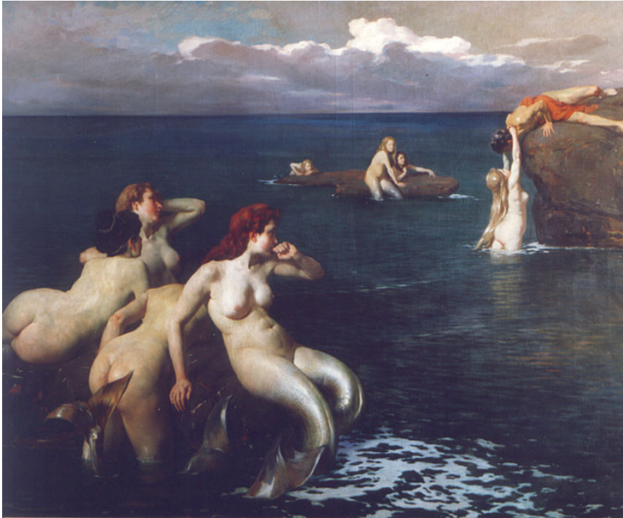
Figure 9 - The Symbolist femme fatale in Cesare Viazzi's 'Sirene' (1901).

Cesare Viazzi's painting 'Sirene' (1901) (Figure 9), meanwhile, presents his figures as more viscerally threatening. His sirens possess sharp, weapon-like, gun metal grey fish-scaled legs ending in fins and lurk at the surface of the still, dark water with poised lethality. In the background right of the image, Viazzi returns to the motif of the seductive female pulling a male into the ocean depths. Landscape elements are minimal, the sirènes partially submerged. Both Point and Viazzi's representations draw strongly on (sometimes multiplicitous) mythological references symbolically and narratively conveying figures of fascination and deadly potency.