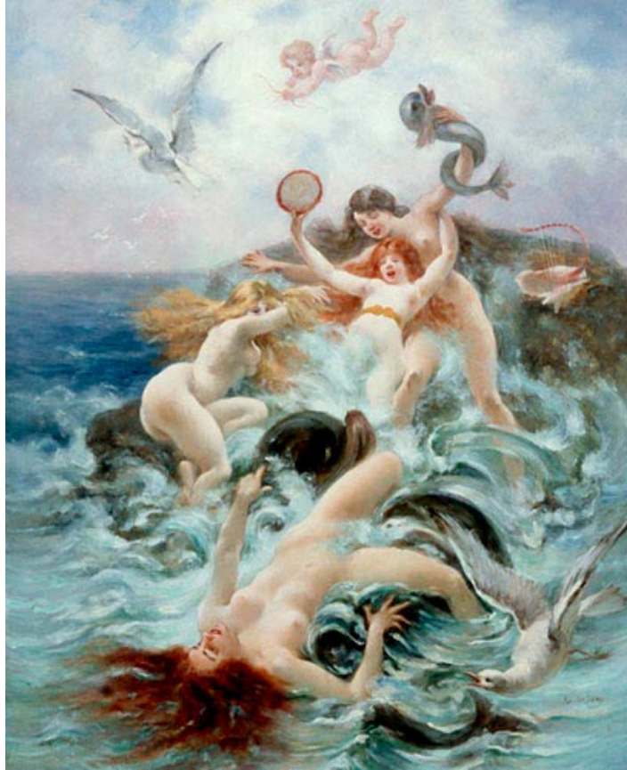
Figure 13 – Lalyre’s ‘Nereids’ (date unknown).