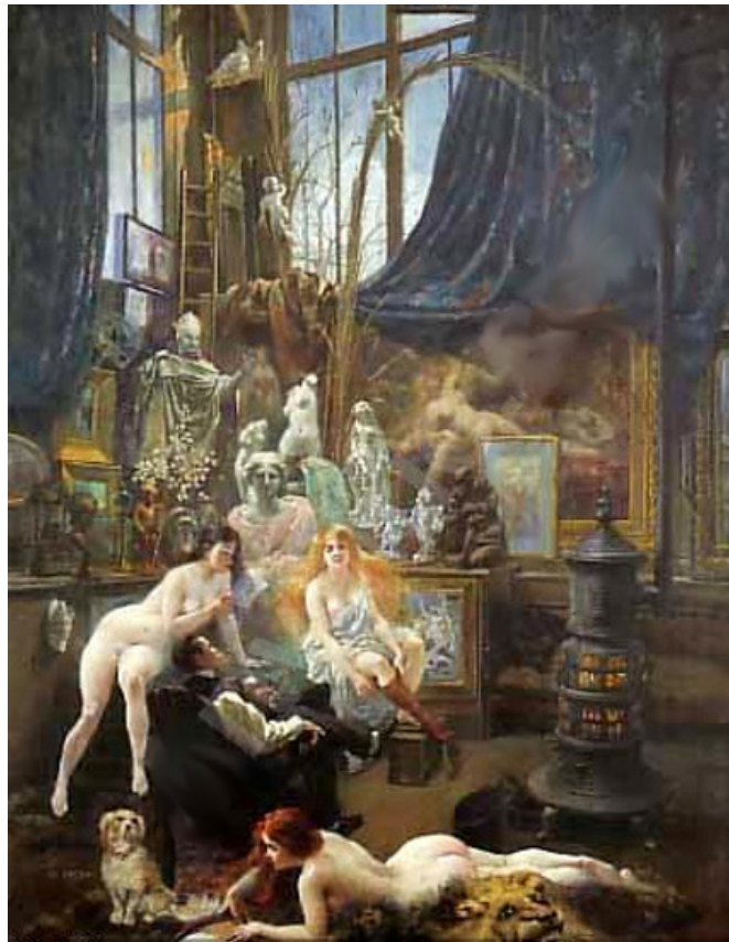
Figure 15 - Lalyre's 'Auto-portrait dans l'atelier' (date unknown).

The final painting considered in this article is Lalyre's self-portrait in his Carteret studio (Figure 15). In this work, he is depicted as turned away from the viewer, lost in contemplation of his models and paintings. He is encircled by three female figures, including one in the foreground seductively sprawled across an animal-skin rug. His female nudes are once again bathed in light to highlight their translucent flesh. Lalyre used Carteret as a place to turn away from many of the formal and philosophical concerns of the Modernist period. It was a retreat from the pressures of urban life but also from changing conceptions of gender. Lalyre's aesthetic style combined the academic religious and mythical elements of l'art pompier , Romanticist notions of personal expression, Impressionist elements and a Symbolist thematic focus on sirènes , touching on the surreal and the pornographic. In geographical and cultural terms, Carteret was slightly further afield than the well-worn paths of Le Havre and Dieppe. In this more sparsely inhabited (and thereby less scrutinised) space Lalyre's work was free to dwell in erotic decadence, out of the purview of tastemakers, in a sphere of arrested fantasy. The result is Lalyre's idiosyncratic vision of an eroticised liminal space where human meets nature and shore meets land. Lalyre makes of this space a desirous entanglement, equal parts Edenic realm and pornographic precipice.