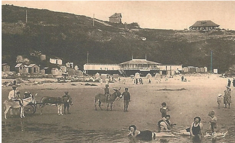
Figure 2 - The beach at Carteret at the beginning of the 20th Century (undated postcard)

Carteret (known as des bains de mer ) were introduced and by 1913, there were 45 holiday villas in the area. Lalyre's first visit to Carteret was in 1872 and he frequently visited thereafter, usually staying at Le Grand Hotel de la Mer. In 1903 he bought a vacant lot on which he built a house containing large studio which he named Le Château des Sirènes. The pattern of attraction to and valourisation of coastal locations such as Carteret exemplifies the emergent social and cultural phenomenon of "desiring the shore," as referred to by French historian Alain Corbin in his pivotal work Le territoire du vide: L'Occident et le désir de rivage (1750-1840) (1988), published in English language translation in 1994 as The Lure of the Sea .