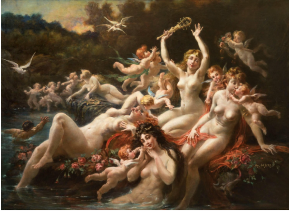
Figure 11 – Lalyre’s ‘Sirènes Lutinées par les Amours’ (1910)