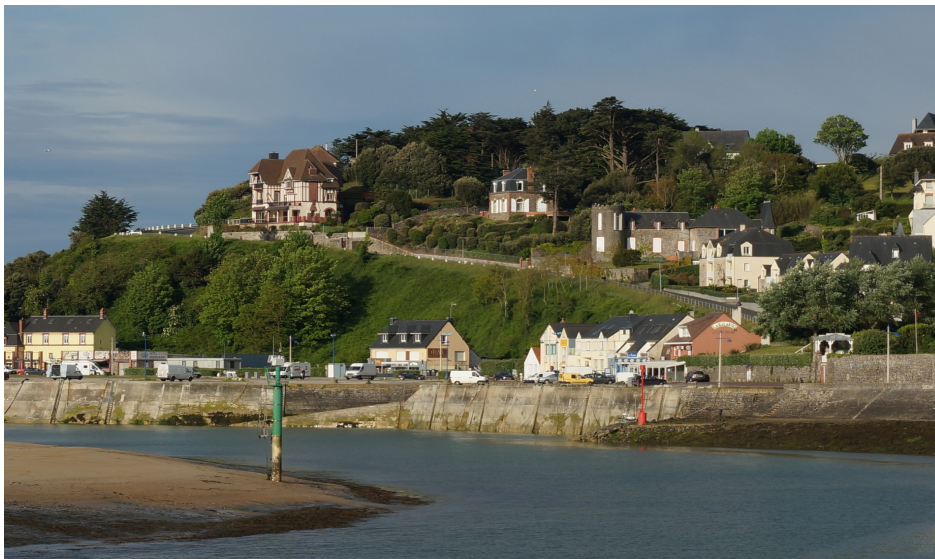
Figure 16 - A view of Carteret Harbour. Le Château des Sirènes is the third house from the left on the hill (May 2017)

What then, is the legacy for Carteret of Lalyre's presence and vision? In fact, there are few traces of his work in the contemporary context of the town. The stained-glass windows of the Church of Saint-Germain le Scot were destroyed in an Allied air raid in the summer of 1944. Château des Sirènes, though still visible (see Figure 16), is no longer owned by the artist's descendants, nor is it heritage listed or featured as a landmark in tourist guides.