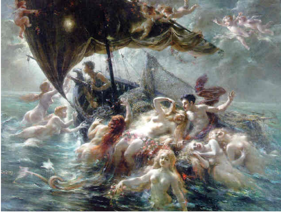
Figure 12 – Lalyre’s ‘Chansons des mer’ (1912).

‘Nereids’ (date unknown) (Figure 13) provides a more elaborated representation of the marine forms suggested below the surface of ‘Chansons des mer’ and offers one of Lalyre’s most vivid depictions of the sea creatures that occur as details in other works. While ambiguous as to whether there is a single entity or group of creatures in the waters, the sea gives forth a nest of tentacles that interweave in and around the intimate crevices of the nereids’ bodies. While apparently enraptured, the nereids appear to have been abruptly thrown from their rock and into the swell. One redhaired nereid arches back into the waves, with an expression of serene pleasure, as tentacles and cresting waves surge between her legs. Another redhaired nereid is cast back against the body of the figure behind her in the thrust of the ocean spray. The background figure brandishes a small eel creature that appears as a phallic plaything. The figures laugh, intertwined with the creature(s), as a cupid points his bow and arrow, symbolically bestowing Eros to the totality of the scene.