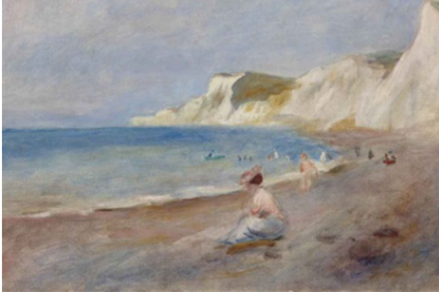
Figure 4 – Auguste Renoir’s ‘La plage de Varengeville’ (c1880).