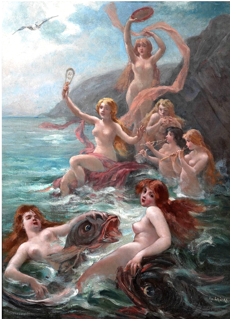
Figure 5 – Lalyre's 'Le concert des sirènes' (1922)

groups. The five at the rear are posed in concert, playing archaic classic instruments, while the two in the foreground tumble in the surf, as waves crest and foam in and around their soft, ample flesh. Two prominent large-mouthed sea creatures cavort proximately to their bodies in the foreground, suggesting their intimate caress of the sirens' breasts, pubic areas and posteriors. In this scenario female carnality is implicated in bestial desire. This type of configuration is typical of many of Lalyre's sirène paintings. Noticeably absent are the human male bodies of sailors, either being carried to safety or being seduced to their demise. Rather, as will be discussed in detail below, Lalyre's images appear to contemplate female amusement (and pleasure) as (at least partially) a circuit of desire between female bodies and the sea and the creatures that inhabit it — a scene frequently marked by orgiastic excess, engulfment and female gratification.