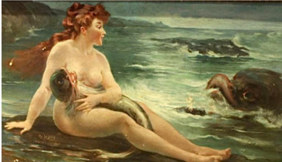
Figure 14 – Lalyre’s ‘Nu aux dauphins’ (circa 1910)

Ultimately, the sea is not a zone of alien emptiness in Lalyre’s work. Instead, its surface often shows a writhing mass of aquatic life that sometimes seems akin to the tentacles of a single (kraken-like) entity or, more often, that of a batch of large, eel-like creatures wriggling amongst each other. These creatures – whether simply unspecified details within broader canvases or, peculiarly identified in titles as dauphins (dolphins) — are in fact grotesque fantasy figures with cod-like heads and gaping maws and elongated tails. Their wriggling phallic forms bump against, curl around and interpenetrate groups of sirènes . The sirènes ’ responses to these advances are variously comfortable or rapturous. The scenes do not suggest unwelcome bestial predation but rather the opposite. In these scenarios the sirènes are not human creatures inhabiting the integrated terrestrial and aquatic space created by human livelihood activities described by Hayward (2014) and Suwa (2017) as an aquapelagic zone, but, rather, they appear as liminal “boundary riders” of the terrestrial zone, adhering to rocks and shallows but intrinsically integrated with the aquatic space and its agents.