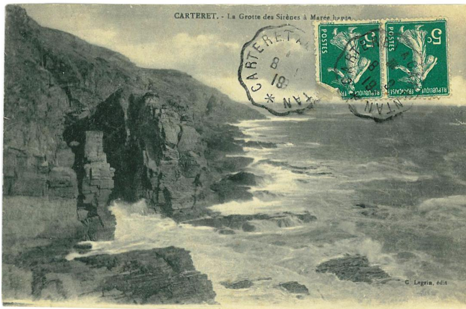
Figure 17 - Carteret postcard – 'La Grotte des Sirènes a Maree' (mid-1900s)