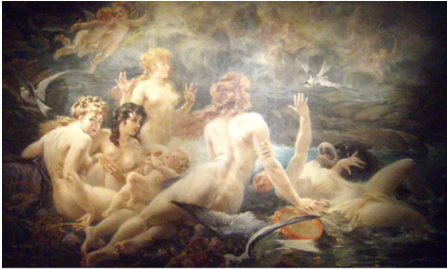
Figure 10 – Lalyre’s ‘Les Sirènes visitées par les muses’ (date unknown)

in the flesh of the surrounding female figures. A pair of cupids is also depicted in the skies in embrace, enamoured of one another, and curiously serene in the face of the oncoming muses. Once again, mythological connotations serve secondarily to the overridingly sensual and fecund.