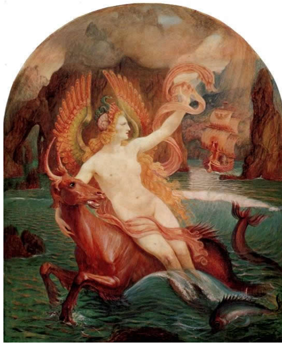
Figure 8 - The Symbolist femme fatale in Armand Point's 'Les Sirènes' (1897).