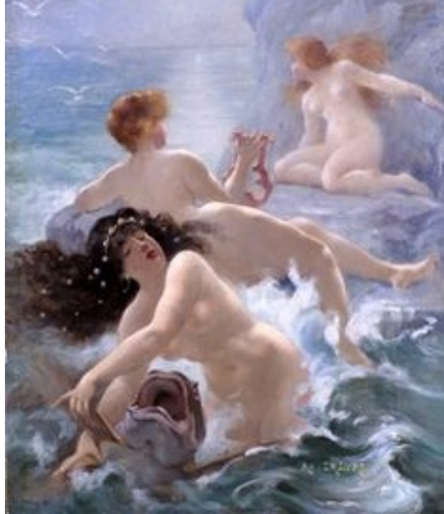
Figure 7 – Lalyre’s ‘Sirènes dans le surf’ (‘Sirens in the Surf’) (date unknown)

Lalyre’s paintings often depict his sirènes in teeming multiplicities, emerging from the waters on their bellies or backs like large catches of fish. In these, his female figures are not individualised, but rather essentialised, nearly devoid of all artifice and modernity.