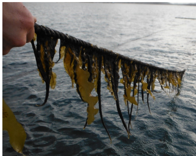
Fig. 1. Cultivation of Saccharina latissima on a 50 m rope at the cultivation site.

Spores were released by placing the sori in a 15 L tank for 2 hours at 15 °C. The resulting spore suspension was