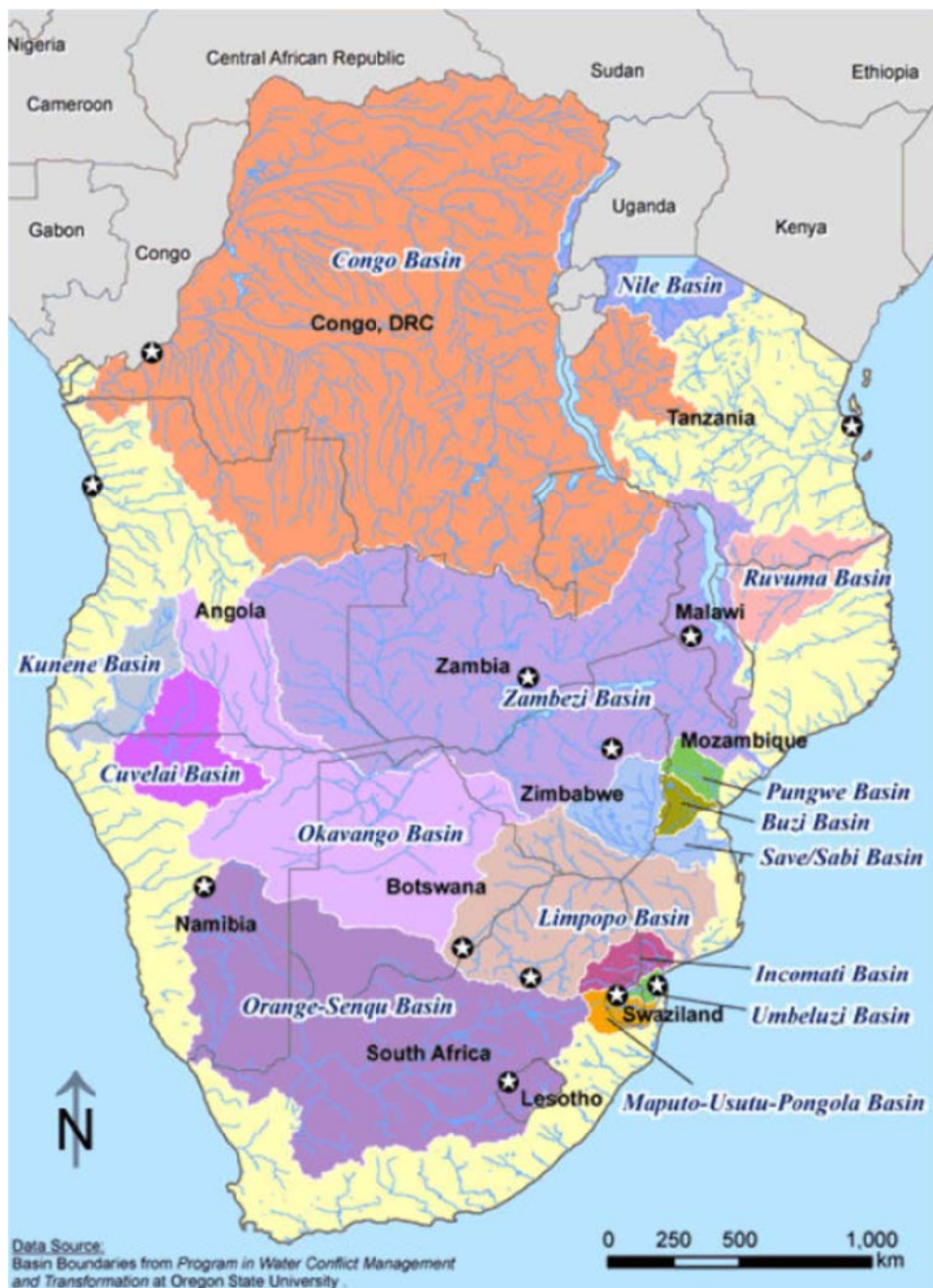
Figure 3: River basins within SADC

As an example of a key initiative that is underway, SADC has embarked on a Groundwater and Drought Management Project 2007 to 2011 supported by GEF/WB. This will build capacity, knowledge products and tools related to groundwater management in the region. As part of the project, a groundwater management institute, hosted by Institute for Groundwater Studies, University of the Free State, Bloemfontein, South Africa, is being established to strengthen and support ongoing initiatives for regional collaboration and capacity building in groundwater management.