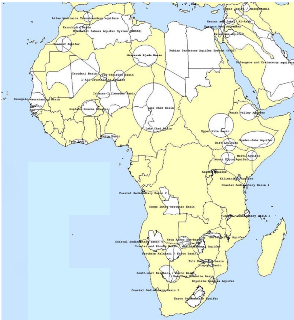
Figure 1: Identified transboundary aquifers of Africa

An international transboundary aquifer can be defined as an aquifer system with physical boundaries that extend over one or more administrative boundaries with heterogeneous administrative arrangements. Most of the major aquifer systems in Africa are shared by two or more countries and so, transboundary aquifers represent highly important groundwater resources in Africa. The Intergovernmental Council of UNESCO's International Hydrological Program (IHP) launched the International Shared Aquifer Resources Management Project (ISARM) after its 14 th session in June 2000. Inter-agency cooperation arising from ISARM (UNESCO-FAO-IAH-UNECE) identified 40 major transboundary aquifer systems in Africa (Puri and Aureli, 2009).