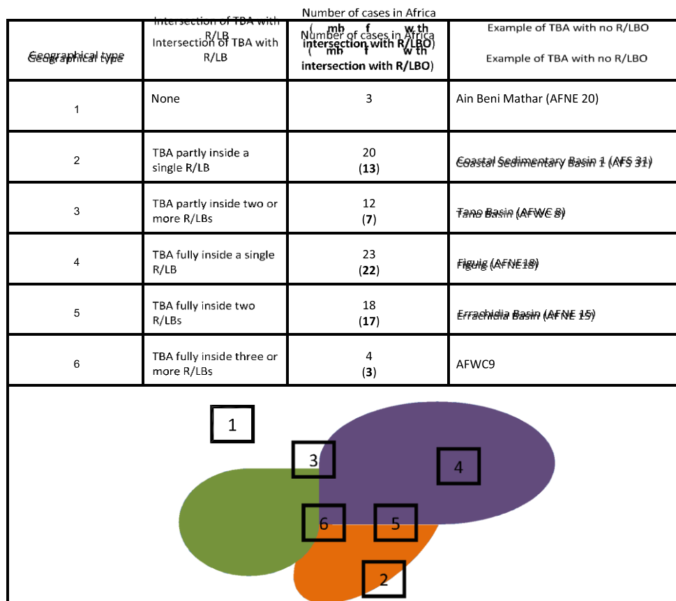
Fig. 2 Conceptual configuration of TBA location in relation to international river and lake basins (R/LBs); polygons represent river/lake basins, squares represent TBAs

Whichever institutional setup is chosen for particular TBAs will depend on the trade-off between these advantages and disadvantages and the geographic, hydrogeological, socio-economic, and political context. R/LBOs and RECs