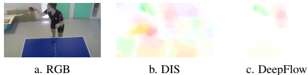
Fig. 2. Optical Flow comparison

The third method, denoted 'LOG', is similar to the previous one but takes the logarithm of the distribution over the whole dataset of frame maximum absolute values of a component (Eq. 2).