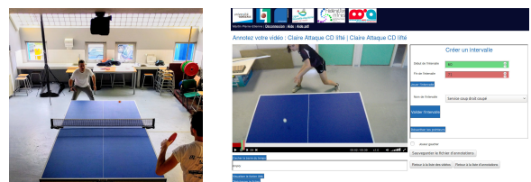
a. Video acquisition

Different Optical flow methods were investigated [3]. A region of interest (ROI) of size (W, H) is then inferred from the center of mass of the foreground motion amplitude map (Fig. 2).