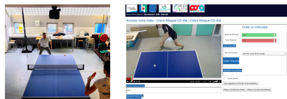
a. Video acquisition

Different Optical flow methods were investigated [3]. A region of interest (ROI) of size (W, H) is then inferred from the center of mass of the foreground motion amplitude map (Fig. 2).