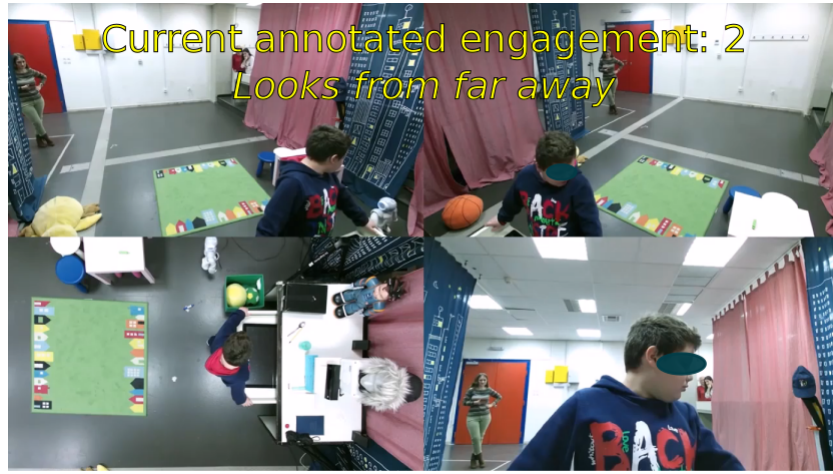
Fig. 1. Pilot child-robot interaction study with children with ASD. The figure shows a moment where a child with ASD showed moderate engagement while the robot moved its arm up and down to point at an object on a table.

robot. In contrast, children with mild symptoms displayed great enthusiasm and interest in playing with the robot as well as with the researcher and enjoyed the whole process. These children were able to respond quite well to the task and completed the experiment with success. Overall, we found that two out of eight children with mild symptoms successfully maximized their engagement in joint attention with the robot and gave the object to the robot spontaneously. The remaining six children successfully increased their engagement, although not optimally, ending up moving the object closer to the robot but not handing it in. The two children with moderate symptoms also increased engagement and ended up exploring the object pointed at by the robot. Finally, again children with severe symptoms did not respond to the task.