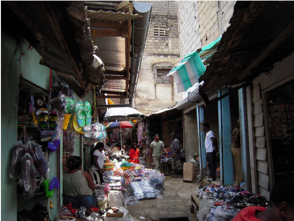
Figure 4. Behind-the-scenes of Chinatown: small shops run by small traders