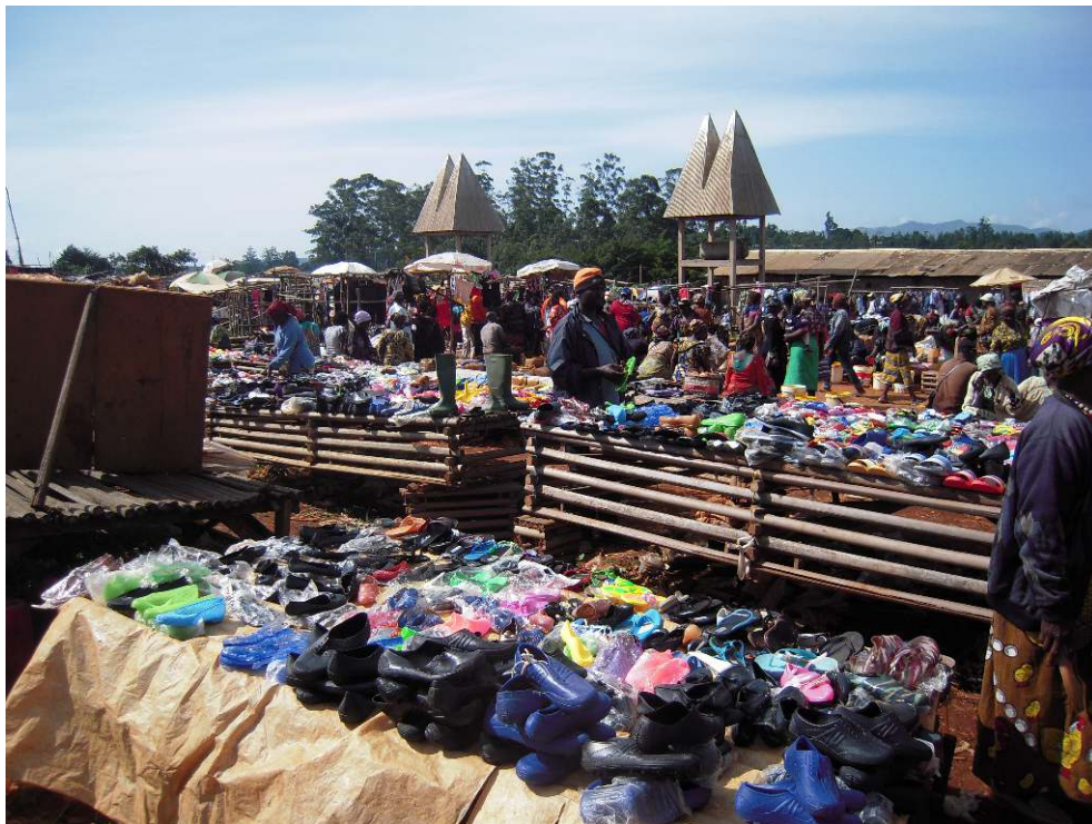
Figure 6. Plastic sandals' section in Baleveng market