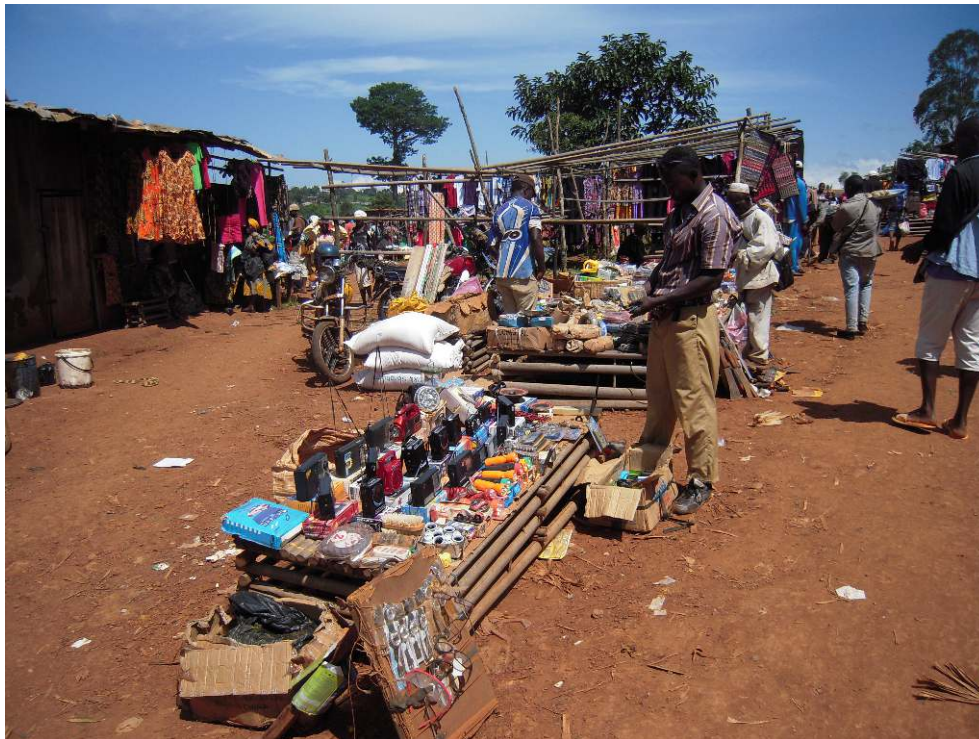
Figure 9. Young hawker at the beginning of its career