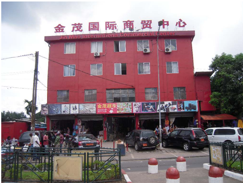
Figure 1. Jin Mao International Commercial Center on the President Ahidjo Boulevard

THIS KIND OF BUILDING, WITH EMBLEMATIC ATTRIBUTES OF GLOBALIZATION, IS THE MODEL OF THE NEW BUILDINGS IN CHINATOWN, AKWA, DOUALA.