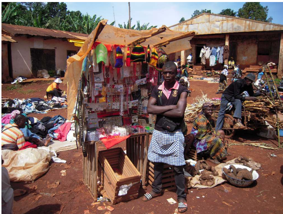
Figure 5. Rural markets are a collection of several trade routes