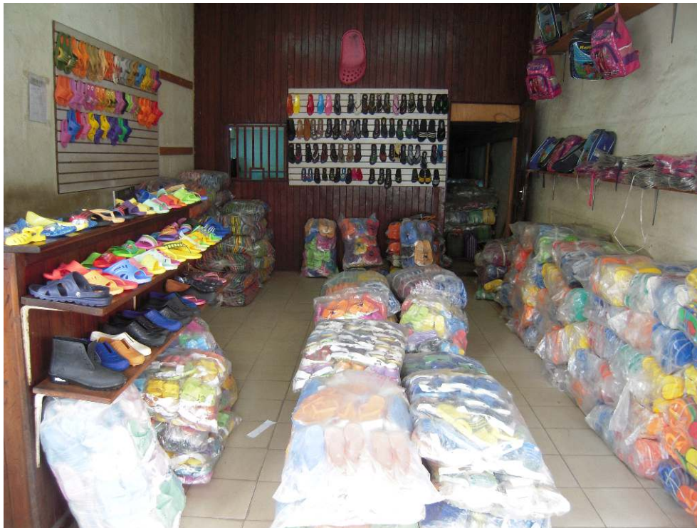
Figure 2. Specialized wholesale shop in an ancient building by the side of the President Ahidjo Boulevard