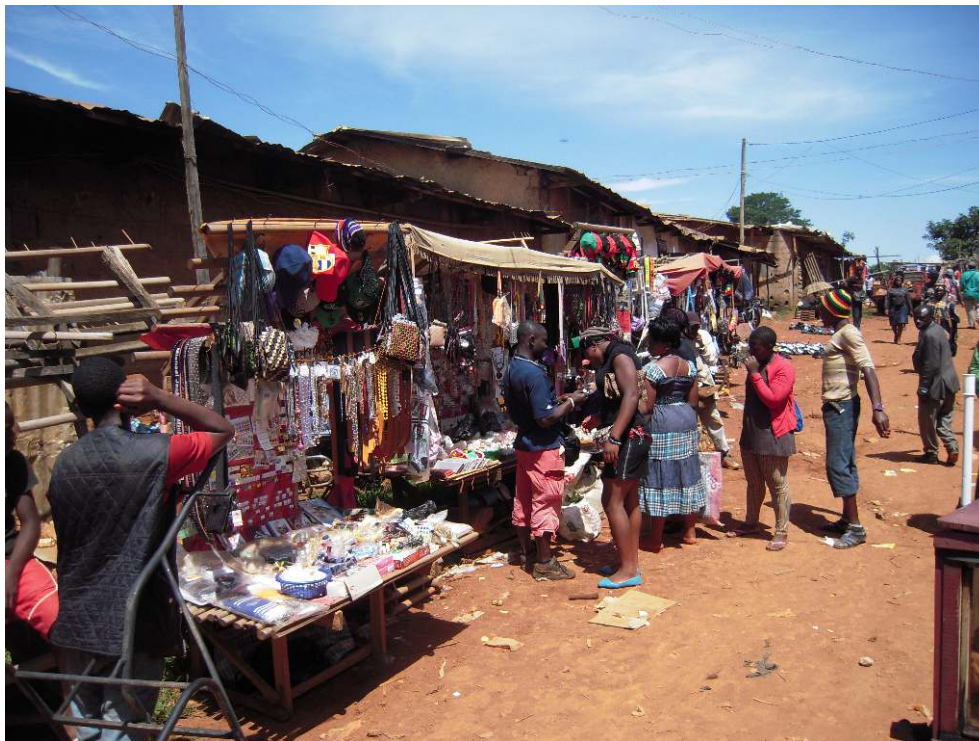
Figure 7. Fashion accessories displays in Batcham market