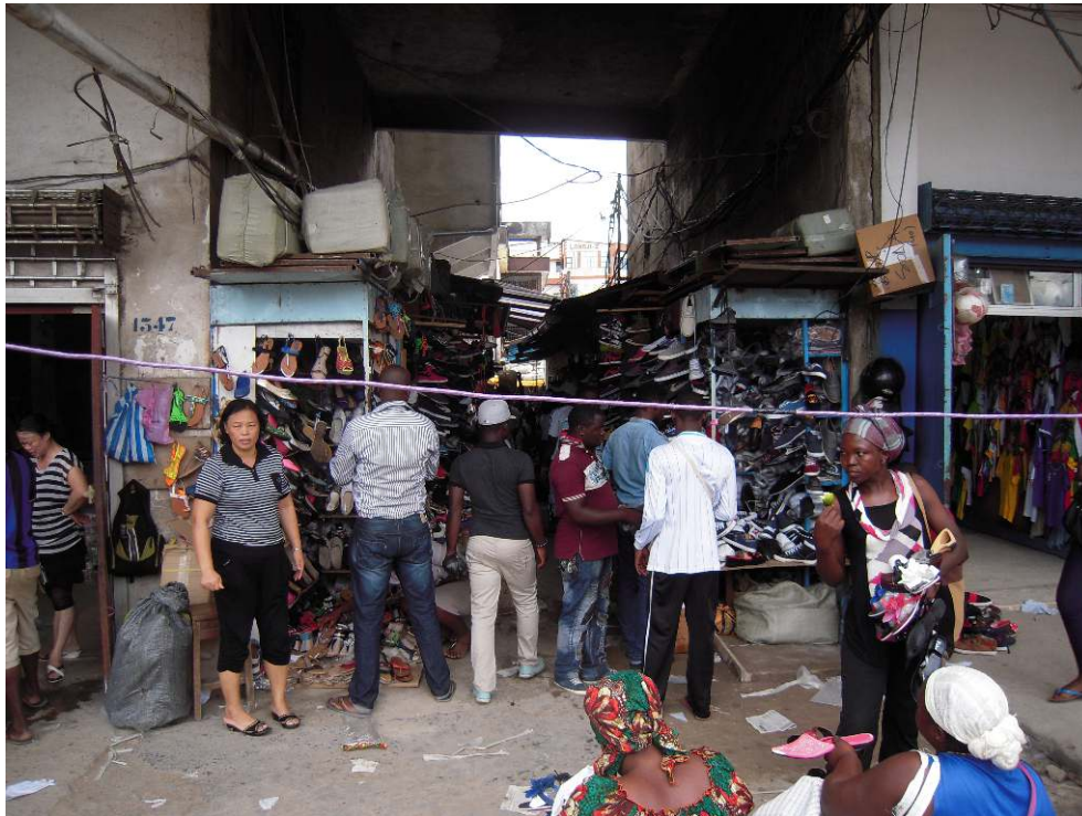
Figure 3. Basic commercial displays in the interstices leading behind the scenes

there are two main ways to get access to a piece of pavement: co-optation by a vendor and/or physical strength. In addition, such spaces are often appropriated by the owners of adjacent buildings; they rent out these spaces which are in reality a public space. Rent prices have increased to peak status; the monthly rent of a 12m 2 shop is 1,000 euros and reaches 2,300 euros for a 25m 2 shop like the one shown on Figure 2. This competition leads sellers to maximize available space, therefore the smallest urban interstices are occupied by commercial displays. The latter are basic, e.g. some kiosks in which the boards are removed during the day to display the goods (Figure 3).