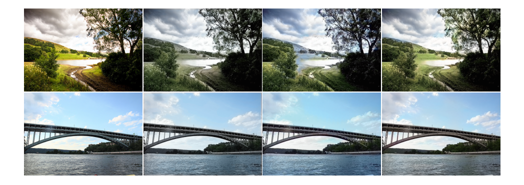
Figure 1: From left to right: each row includes a natural image taken from ImageNet [3] and three colorized images generated by the colorization algorithm proposed in [8], [13], and [7], respectively.

images, the left-most column is the original color images, and the remaining three columns are colorized images produced by three recent and advanced colorization algorithms (respectively with the name Ma [8], Mb [13] and Mc [7], from left to right), which take the grayscale version of the left-most column as input. It is indeed difficult to distinguish, with naked human eyes, which images are artificially colorized. Accordingly, distinguishing between natural images (NIs) and colorized images (CIs) has drawn increasing interest among the image forensics research community [6, 15].