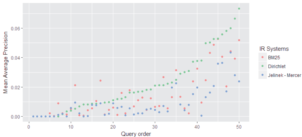
Figure 1. Comparison of the three systems Dirichlet, BM25, and Jelinek on average precision. Queries (X-axis) are ordered by increasing performance of the Dirichlet system based on the average precision (AP) values.

system for which s/he wants to visualize the results and decide the number k of top retrieved documents (cut off of the retrieved document list) to be considered to plot recall/precision curves. In that case each query is plotted individually. k is in the range [1,2,5,10,15,20,30,50,100,200,500,1000].