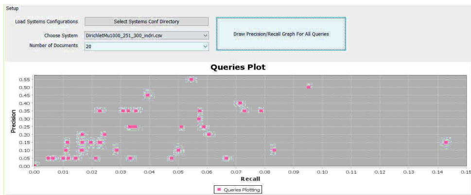
Figure 2. Plotting the recall and precision values for all the queries evaluated by Dirichlet system when 20 top retrieved documents are considered ( R@20 , P@20 ); other values of cut off of the retrieved document list can be chosen for the visualization as well as any other couple of measures.

system for which s/he wants to visualize the results and decide the number k of top retrieved documents (cut off of the retrieved document list) to be considered to plot recall/precision curves. In that case each query is plotted individually. k is in the range [1,2,5,10,15,20,30,50,100,200,500,1000].