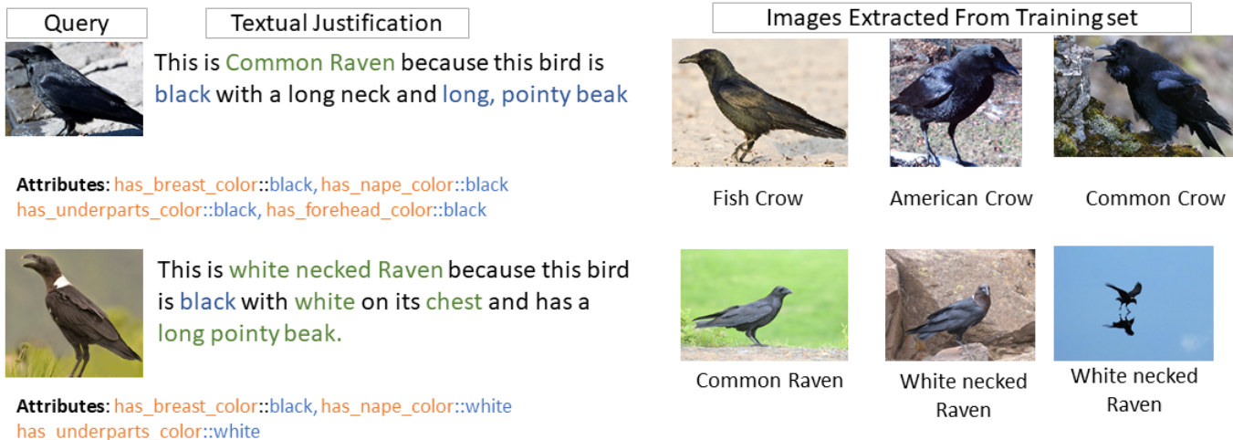
Fig. 4. Some negative examples predicted by the EVCA justification system, where it is able to predict some attributes but those are also common in other classes.

is specified by the white colour on its nape. Similarly, the images extracted from training set do not justifying correctly the decision.