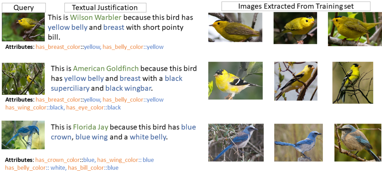
Fig. 3. Visual Explanation Generated by the EVCA justification system where attributes are verified by ground-truth and predicted attributes and these attributes can be find in the images extracted from training set.

which has been done by [31], where they collected 5 sentences for each image. These sentences describe the content of the image, e.g., “This is a bird” but also give detailed description of the bird by mentioning their attributes e.g., “it has cone shaped beak, red body and a grey wing.” We selected this image-sentence dataset because every image is belong to a certain class and therefore sentences and as well as images are associated with a single label. The sentence also contains the features of the bird present in the image which make this dataset unique for the visual justification task. The sentence collected in [31] were not collected for the visual explanation task that is why it does not describe why the image belongs to certain class but a descriptive detail about each bird class [23].