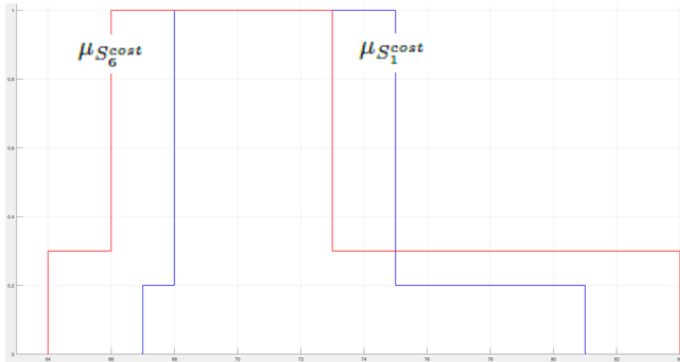
Fig. 2. Modeling of the values of a decision criterion