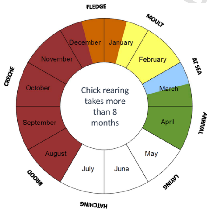
Fig. 1. Emperor penguin breeding cycle. Adapted from Wienecke (2010). Note that timings can vary between sites.

All colonies that have been studied so far have a similar annual schedule (Fig. 1). Prior to breeding, both males and females must forage intensely to build their body reserves, necessary for females to lay their single egg, and for males to fast whilst undertaking the entire egg incubation. Birds gather at their preferred sites from April onwards, upon development of stable fast ice. Courtship, egg laying and incubation occur as winter proceeds. Chicks hatch and are brooded during July and August, the coldest time in Antarctica. Chicks then begin to