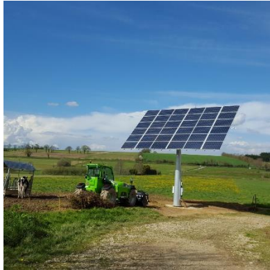
Agricultural exploitation using solar tracker