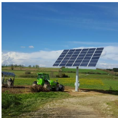
Agricultural exploitation using solar tracker