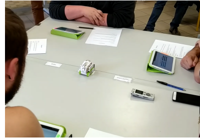
Fig. 2. Layout of the meeting table

vividly. It is also small and able to move easily in the multiple areas present on the table.