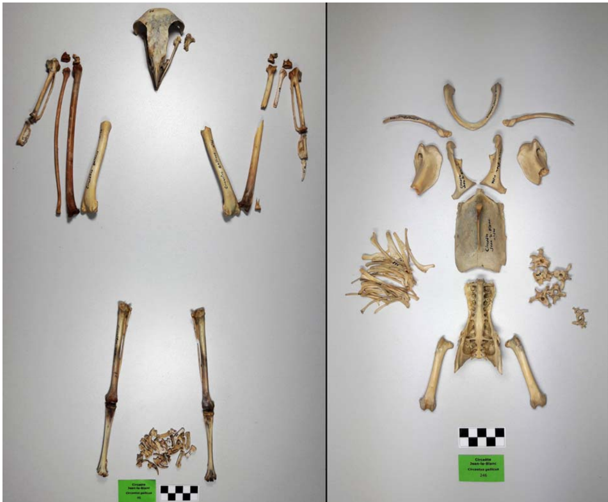
Figure 1. Partial specimens recovered from taxidermists. Left: partial skeleton (wings and skull) of Short-toed Snake-Eagle, Circaetus gallicus (PACEA-O-46) obtained by recycling a stuffed specimen. Right: postcranial axial skeleton of an individual of the same species (PACEA-O-246) obtained by recovering naturalization by-products.

Caractère partiel des spécimens issus de la taxidermie. Gauche : squelette partiel de Circaète Jean-le-Blanc, Circaetus gallicus (PACEA-O-46) obtenu par recyclage d'un spécimen naturalisé et documentant les membres et le crâne de l'oiseau. Droite : squelette partiel d'un individu de la même espèce (PACEA-O-246), obtenu par récupération des sous-produits de naturalisation et documentant le squelette axial post-crânien.