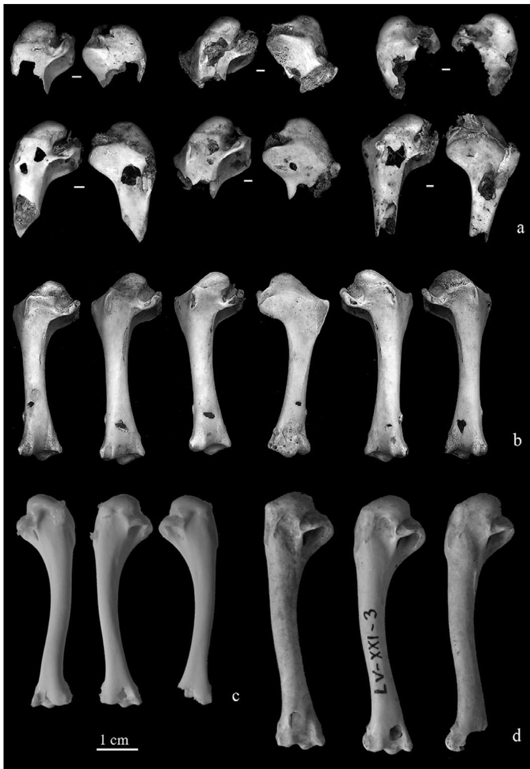
Figure 3. Human and non-human modifications on bird humerus; a) fracturation and bilateral beak impacts on a pigeon humerus observed in modern Bubo bubo pellets, b) beak impact on a pigeon humerus in modern food remains of Falco peregrinus ; c) experimental crushing, notching and tearing on Perdrix perdix produced during the disarticulation of the elbow; d) archaeological crushing, notching and tearing on Lagopus sp. from the Magdalenian site of La Vache (France).

Modifications humaines et naturelles d'humérus d'oiseau ; a) impact bilatéral de bec et fracturation d'humérus de pigeon issu de pelotes de régurgitation de Bubo bubo , b) impact de bec sur humérus de pigeon dans des restes alimentaires actuels de Falco peregrinus ; c) écrasement expérimental, arrachement et encoches obtenus expérimentalement par désarticulation d'aile de Perdrix perdix ; d) écrasement, arrachement et encoches observés sur des restes archéologiques de Lagopus sp. du site magdalénien de La Vache (France).