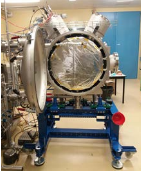
Fig. 2. Frontal view of the XEMIS2 cryostat. The inner chamber is wrapped with a Multilayer insulation (MLI) to reduce heat loss by thermal radiation.

To carry out an efficient and convenient data handling, a dedicated 32-channels low power circuit called XTRACT has been designed [4]. The analog pulses delivered by IDeF-X HD-LXe are then read-out by this new ASIC, in order to extract, from each individual pixel, the relevant information in terms of pulse height and arrival time of the signals. XTRACT includes three main features per channel: a self-trigger functionality with a very low threshold level (3 times the electronic noise) to maximize the detection efficiency, a Constant Fraction Discriminator (CFD) to measure the peak value and the signal arrival time, and an analog memory block that stores both amplitude and time informations of every triggered signal. The CFD parameters have been thoroughly studied and chosen to measure the pulse height at the zero crossing point of the bipolar CFD signal with a time resolution better than 250 ns for a signal-to-noise ratio of 3 [4]. The charge, time and pixel address informations from each channel delivered by XTRACT are read-out and digitized by a Process Unit board (PU). Both XTRACTs and the PU boards are located in the vacuum container at an estimated temperature of the order of -80^\circ and -30^\circ respectively.