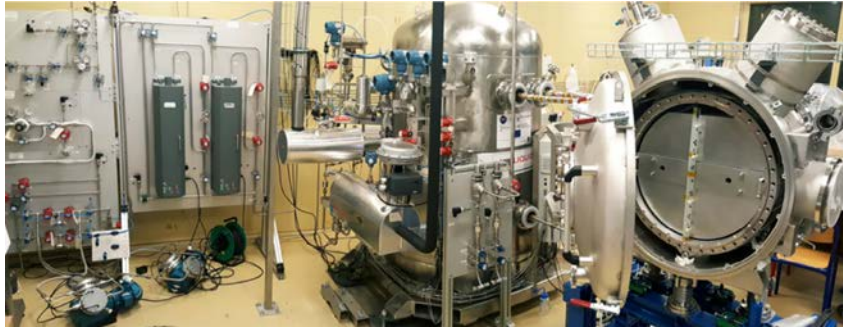
Fig. 3. Overview of the XEMIS2 cryogenics facility. From left to right: purification system, ReStoX and XEMIS2.