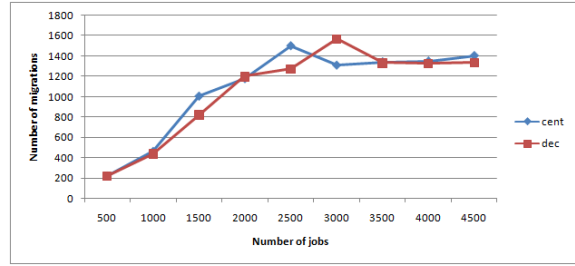
Figure 2: Centralized (Cent) vs Decentralized (Dec) algorithms: Migration.

Typical results of experiments are presented in Figures 1, 2, 3 and 4. In Figure 1 it is easy to notice that energy consumed by the distributed algorithm is comparable to centralized strategy for low number of jobs. These poor results are caused by low number of migrations since majority of jobs can be ex-