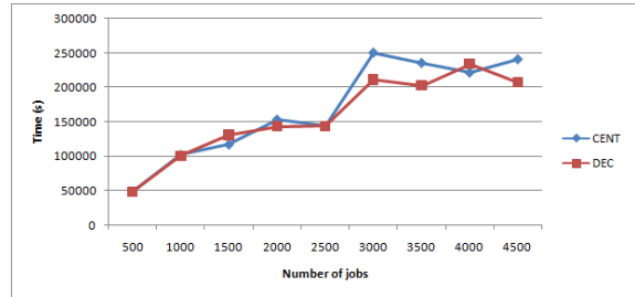
Figure 4: Centralized (Cent) vs Decentralized (Dec) algorithms: Makespan.

cuted without exceeding their due dates. This situation changes for higher loads when number of migrations is increased and the distributed algorithm outperforms the centralized in some case. We achieved similar results for centralized algorithm which use migration and anti load-balancing techniques. When a cluster load is below the under-loaded threshold, centralized and Decentralized algorithm are able to migrate jobs to more-loaded clusters and switch off under-loaded cluster. In this case, performance measures and energy depend strongly on the collaboration of less-loaded clusters. When their cooperation is too low the system as a whole starts to be inefficient, although the performance of the less-loaded clusters is not affected. Consequently, we consider that there must be some minimal cooperation that results from a cloud agreement. As in real systems the job stream changes, this minimal cooperation can be also inter-