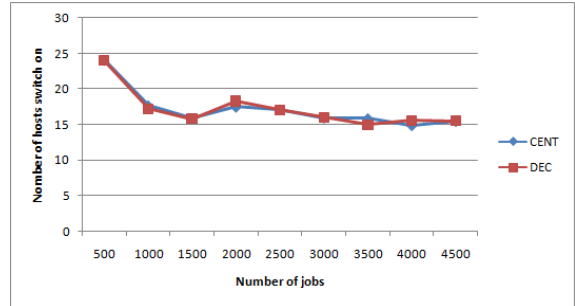
Figure 3: Centralized (Cent) vs Decentralized (Dec) algorithms: Maximum nodes switched on.