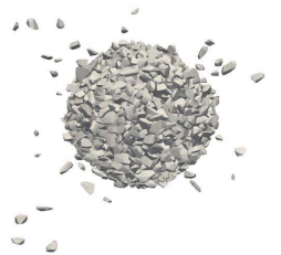
Figure 1: Accretion of 3375 self-gravitating polyhedral particles by means of the CD Method.