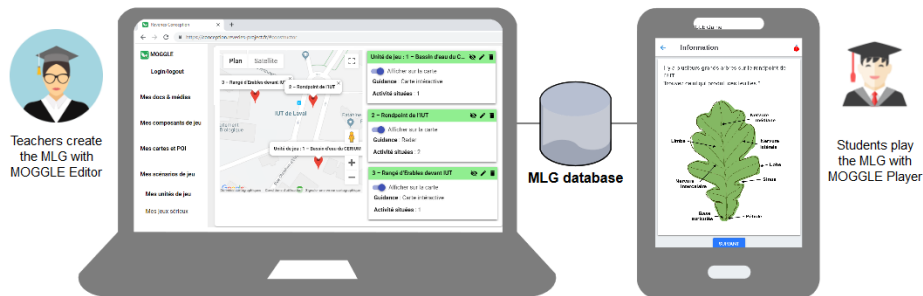
Fig. 1. MOGGLE MLG authoring tool

MOGGLE (MOBILE, Geolocated Games for Learning) is composed of two applications: MOGGLE-Editor (referred to as Editor) that allows teachers to create their MLGs and MOGGLE-Player (referred to as Player), which allows students to play these MLGs (Figure 1). The instances of MLGs are stocked in a shared database.