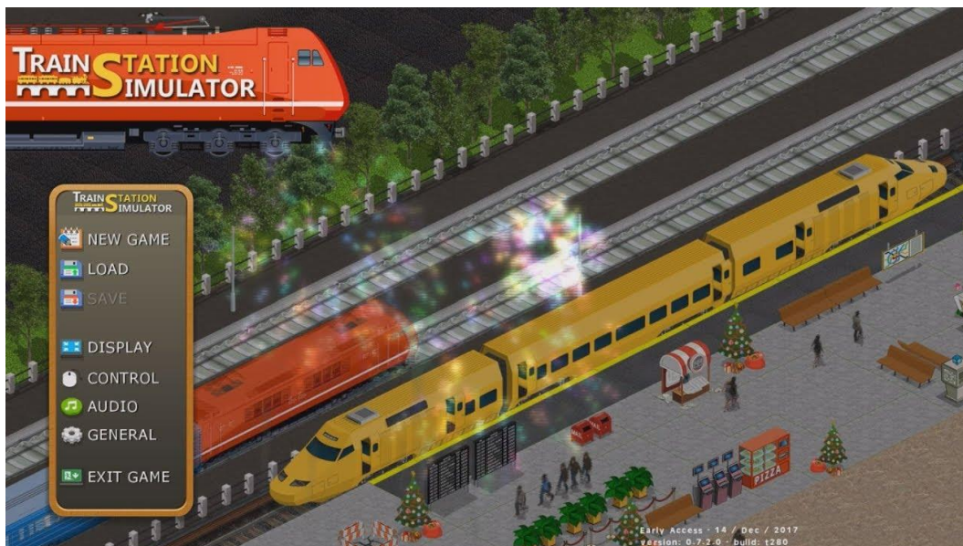
Figure 1. Train Simulator (Electronic Arts) used for training train drivers

Computer games have the advantage of offering adaptable virtual environments that are very useful for recreating specific situations and simulating the context in which learners will use their skills. This is particularly advantageous when the context is impossible or very difficult to reproduce because of its costly or dangerous nature. For example, The Resuscitation Game 4 is used to teach medical procedures and reanimation technics for neonatal resuscitation. Rail Simulator 5 (Figure 1) allows future train drivers to validate their management and driving skills. Virtual Reality is one of the latest advances in simulations. This technology immerses the learners in an interactive virtual world and allows them to practice their orientation and manipulation skills. Virtual reality is also used for simulating stressful situations in order to help learners control their emotions (Marfisi-Schottman et al., 2018; Ponder et al., 2003).