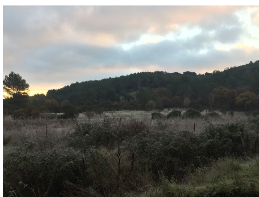
A lignite waste heap completely integrated in the local landscape