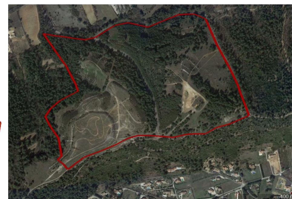
Aerial view of the lignite waste heap of "Le Défens" (Meyreuil)