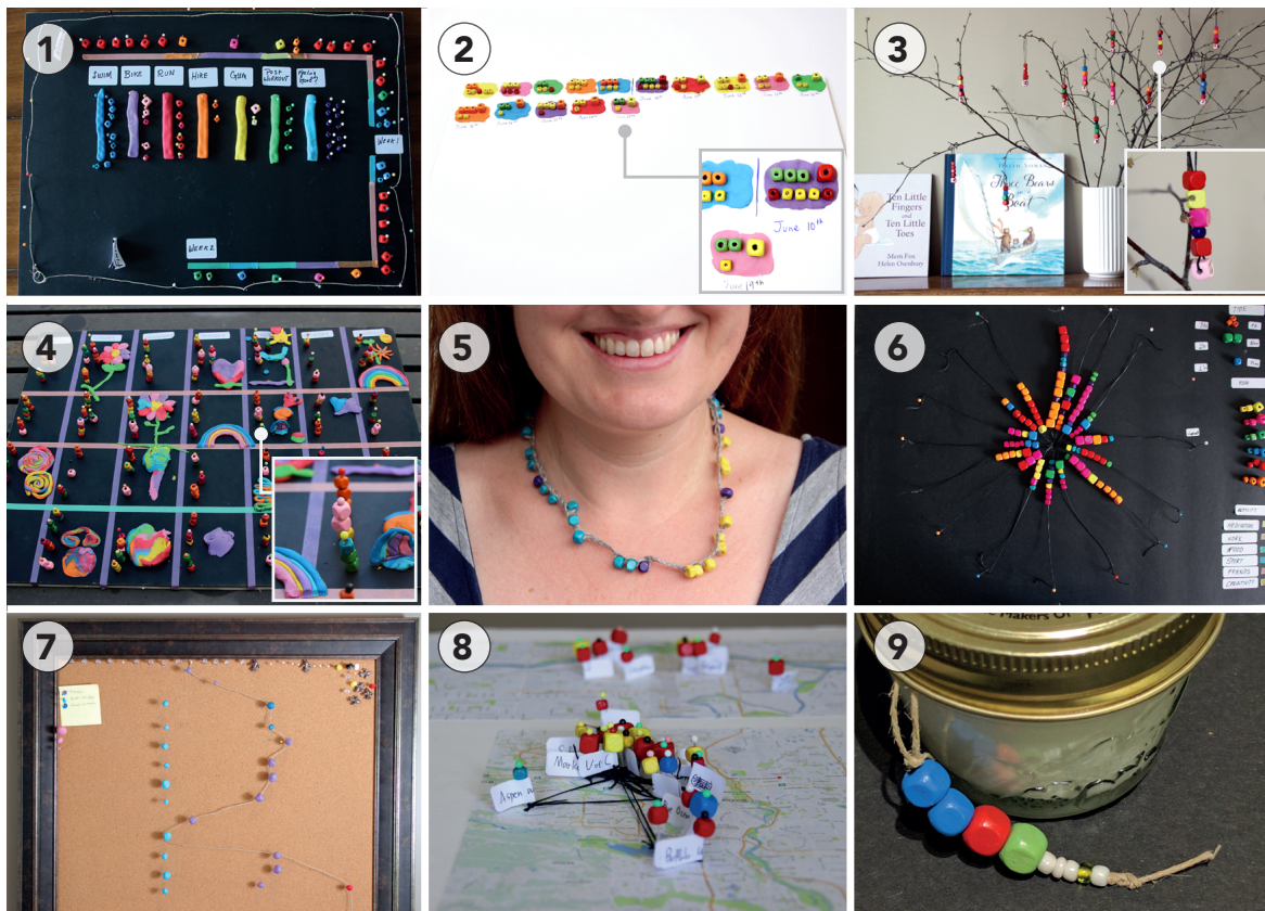
Figure 1. Overview of all 9 participants' projects. The topics are: (1) workouts, (2) hip pain, (3) mood, (4) nutrition and bowel movements, (5) distractions during writing, (6) enjoyment of activities, (7) meditation, (8) places visited in a new city, (9) recipes for homemade care products.

[P5] Distractions during Writing: P5 created wearable physicalizations of distractions during her thesis writing. She anticipated that wearing them would motivate her to be focused. She made one bracelet/necklace for each work day with one stitch representing 3 minutes of work and beads showing times of distraction (see Fig. 1.5). Work sessions are separated with purple beads. The colour of other beads shows whether tasks for each session were accomplished. Because “ the process has not been as motivational as expected ”, P5 started using the physicalization “ in an explorative way ”. This approach helped her develop more productive work strategies. The process further encouraged her to become “ more compassionate ” with her own ways of working.