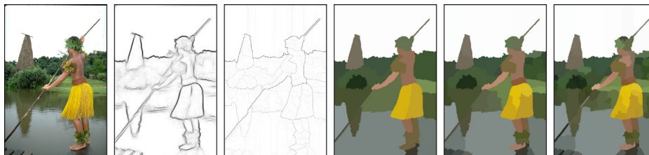
Fig. 2. Image simplification with a watershed hierarchy. From left to right: original image, gradient, saliency map of the watershed hierarchy by area of the gradient, simplified image reconstructed from the hierarchy with respectively 25, 50, and 100 regions.

image = imread("101087.jpg").astype(np.float64) / 255 gradient = imread("101087_SED.png").astype(np.float64) / 255 # Edge weighted 4-adjacency graph graph = get_4_adjacency_graph(image.shape[:2]) edge_weights = weight_graph(graph, gradient, WeightFunction.mean) # Watershed hierarchy by area and its saliency map tree, altitudes = watershed_hierarchy_by_area(graph, edge_weights) sm = saliency(tree, altitudes) imshow(image); imshow(1 - gradient) imshow(1 - graph_4_adjacency_2_khalimsky(graph, sm) ** 0.5) # Get horizontal cuts containing different number of regions # and colorize them with the mean pixel values inside each region mean_color = attribute_mean_weights(tree, image) cut_helper = HorizontalCutExplorer(tree, altitudes) for c in [25, 50, 100]: cut = cut_helper.horizontal_cut_from_num_regions(c) simplified = cut.reconstruct_leaf_data(tree, mean_color) imshow(simplified)