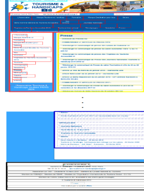
Figure 4: Guided Expan.