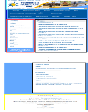
Figure 5: Manual Segm.

In particular, each expert must give a mark ranging from 0 (unacceptable), 1 (bad), 2 (passable), 3 (good) and 4 (perfect). Based on this protocol, the three algorithms presented in section 3 have been tested on a total of 53 web pages from 3 domains: Tourism (23 web pages), E-Commerce (12 web pages) and News (18 web pages), that are part of our TAG THUNDER project corpus 3 . To avoid bias, the experts are unaware of the algorithms strategies he/she is evaluating. Overall results are presented in table 1 and an example of the expert manual segmentation is illustrated in Figure 5.