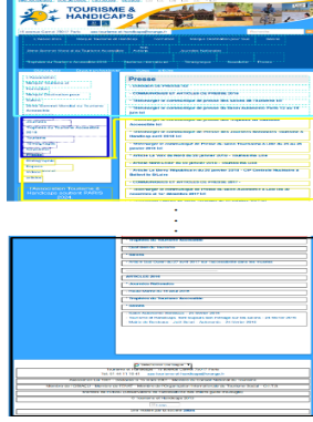
Figure 3: F- K -means