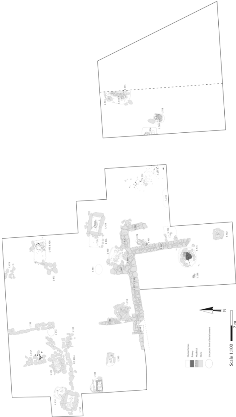
Fig. 1: Plan of the western sector of the excavations (after authors).